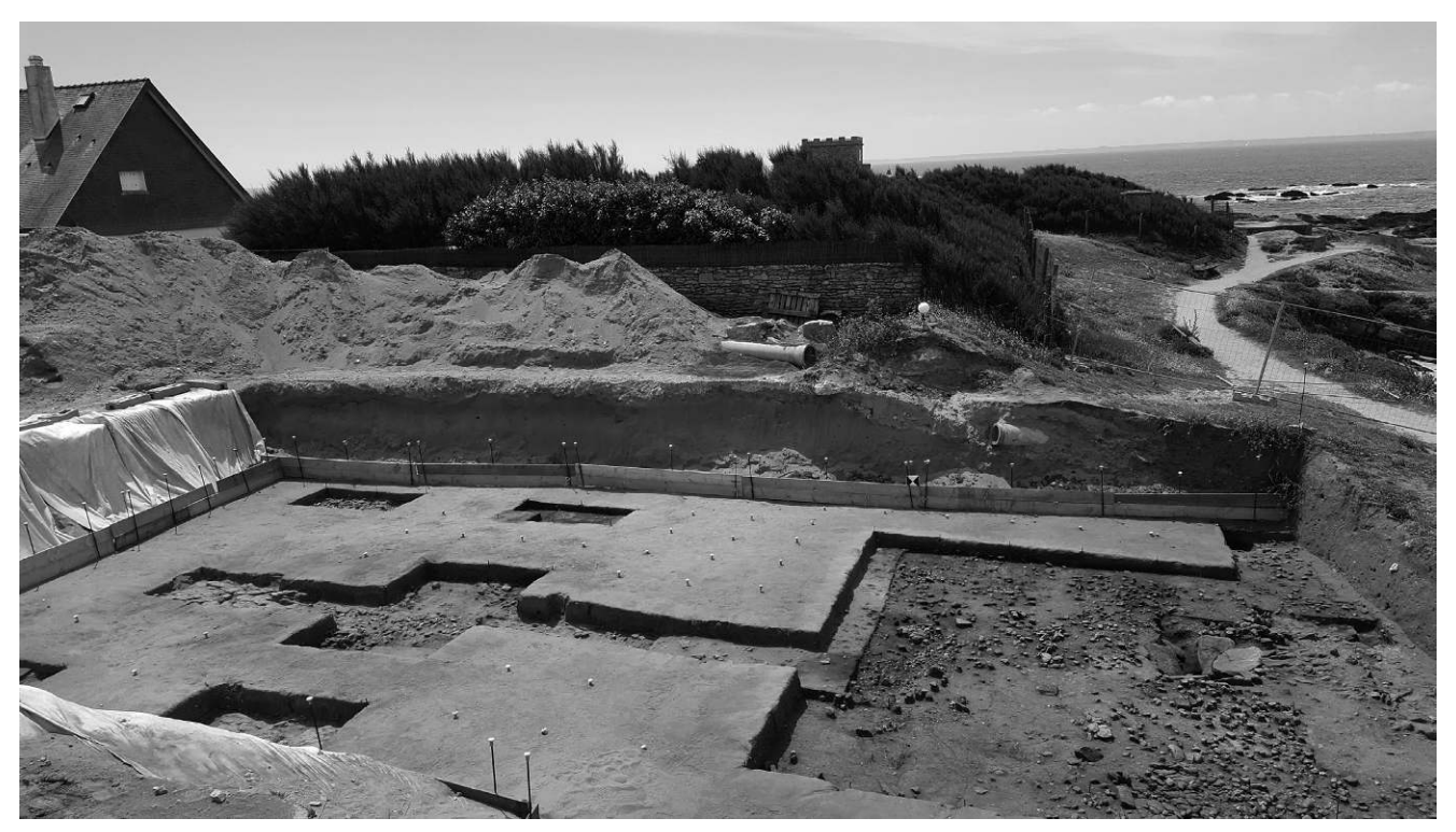
Fig. 3 – Beg-er-Vil (Quiberon, Morbihan). In 2017, the mechanical stripping of the dune (1.8 m thick) and of the overlying parking lot allows to explore the surroundings of the Mesolithic shell midden. At right on the photo is a pit-hearth in the centre of a circular hut.