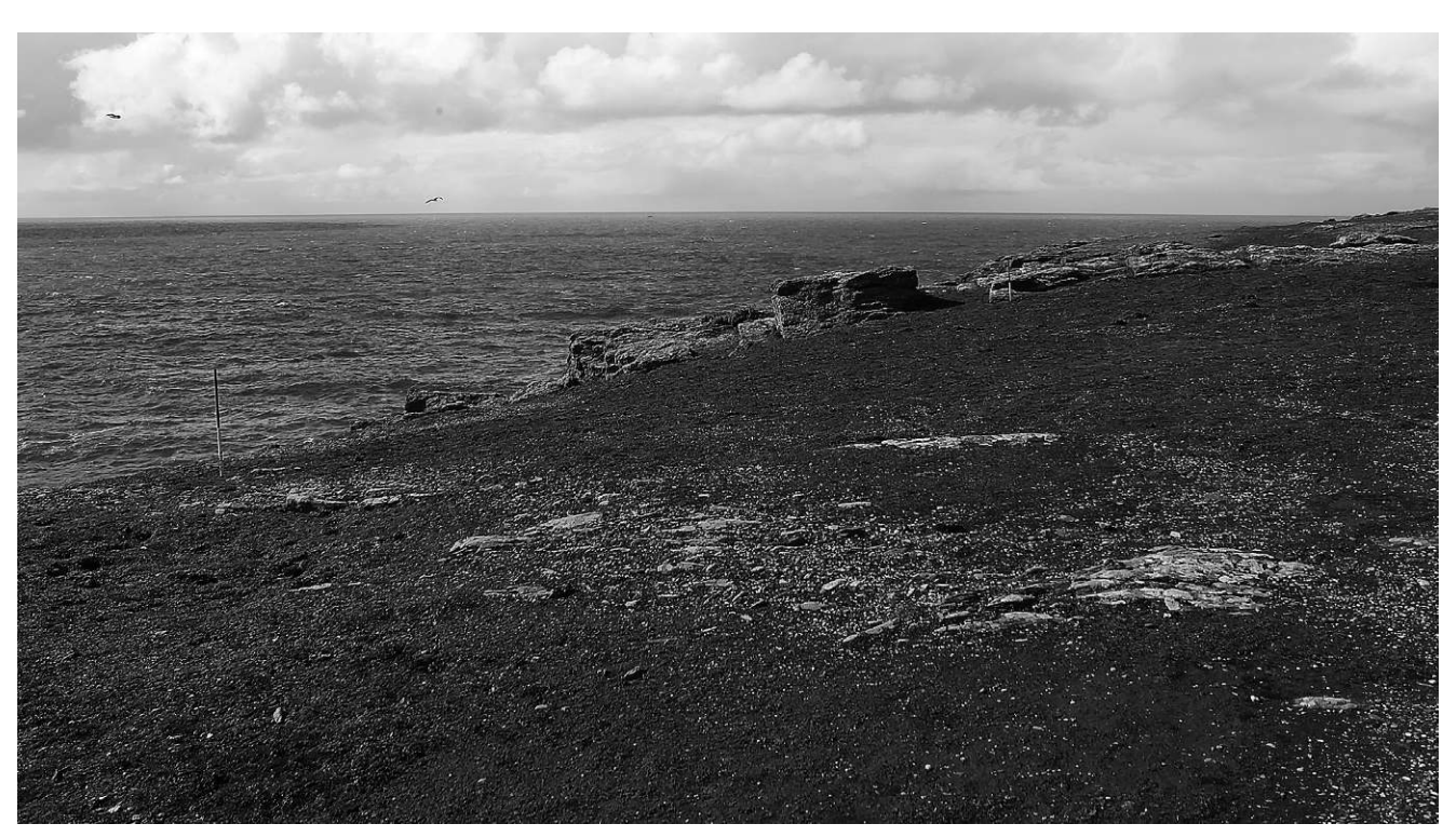
Fig. 5 – Le Gorzed (Groix, Morbihan). The widespread flint around the coastal path bears witness to the presence of a Late Mesolithic habitat (Discovery : A. Le Guen. Photo: G-A. Denat