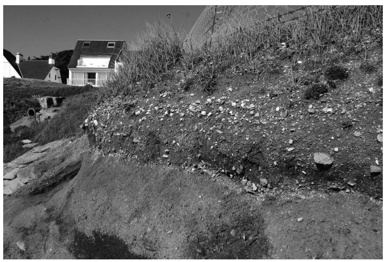
Fig. 2 - Beg-er-Vil (Quiberon, Morbihan). The Mesolithic shell layer is sandwiched between a Pleistocene beach and a dune.