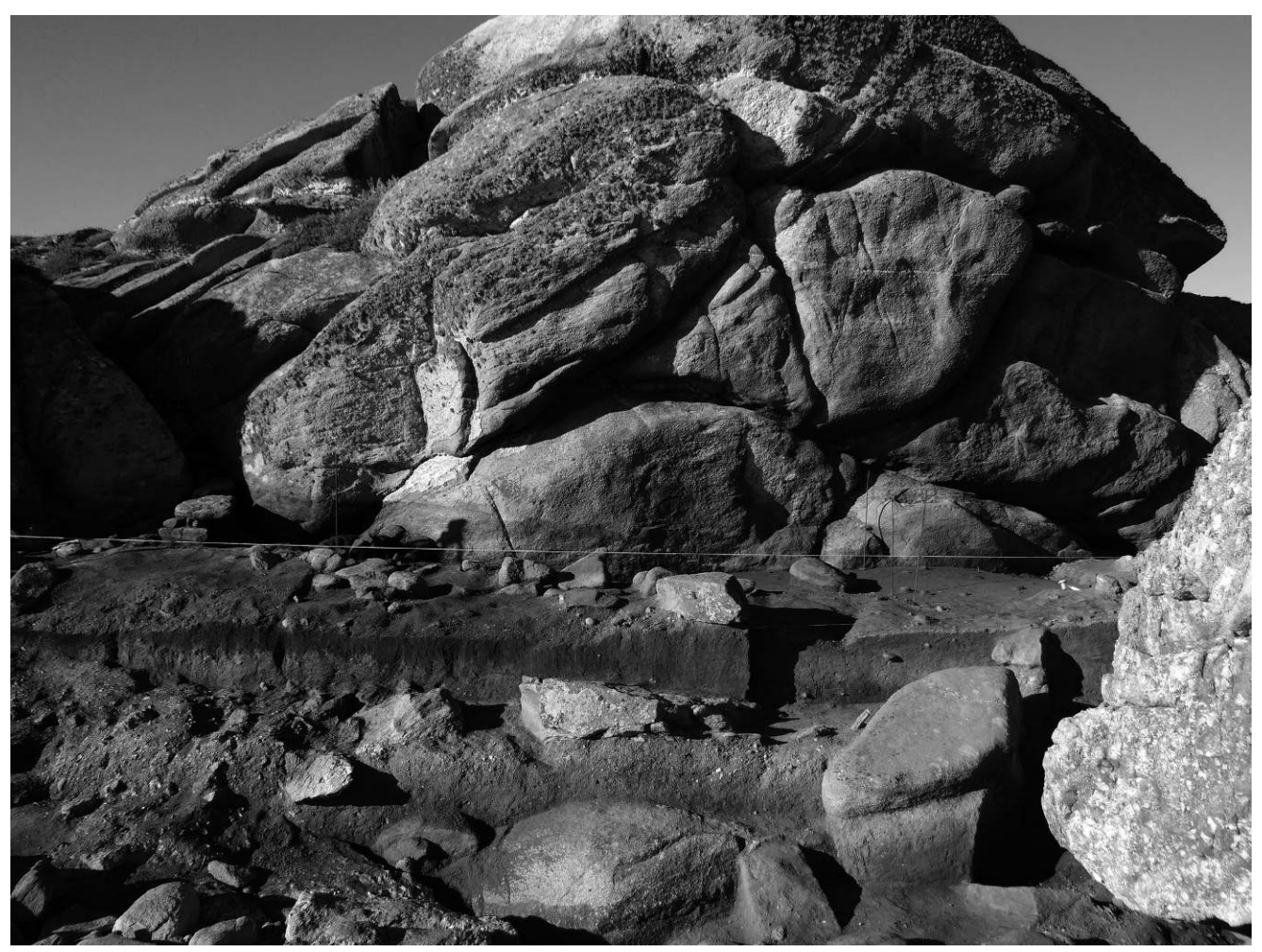
Fig. 4 – Roc'h Santeg Leton (Santec, Finistère), Western Block. The section is thick of 1 m with remains of Protohistory (Gallic) and Prehistory (Middle Paleolithic, Early Neolithic, Early and Late Mesolithic).