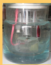
Electrochemical cell and the three electrodes.