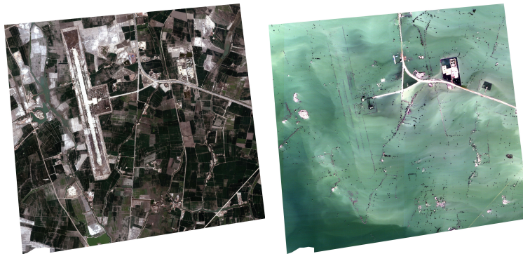
Figure 1: Sehwan Sharif Airport and nearby villages captured on 2022-01-27 and after the flood on 2022-09-24.

In this study we aim to calculate key indicators for water safety during flooding. We use guidelines mentioned in WASH technical area in the Sphere handbook. For this we collect SkySat and Pleiades satellite images (50cm resolution) of flooded regions in Pakistan between July - September 2022. To date, more than 1.14 million houses have been damaged and over 765,000 houses have been destroyed across the country, while over 1,500 deaths and more than 12,800 injuries were recorded since mid-June. Figure 1 shows satellite images captured over Sehwan Sharif airport before and after the floods. Before and after images for two more cities, Kairpur and Qambar were also collected.