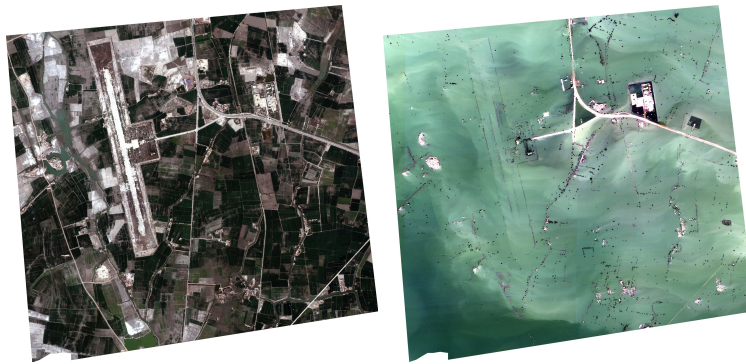
Figure 1: Sehwan Sharif Airport and nearby villages captured on 2022-01-27 and after the flood on 2022-09-24.

In this study we aim to calculate key indicators for water safety during flooding. We use guidelines mentioned in WASH technical area in the Sphere handbook. For this we collect SkySat and Pleiades satellite images (50cm resolution) of flooded regions in Pakistan between July - September 2022. To date, more than 1.14 million houses have been damaged and over 765,000 houses have been destroyed across the country, while over 1,500 deaths and more than 12,800 injuries were recorded since mid-June. Figure 1 shows satellite images captured over Sehwan Sharif airport before and after the floods. Before and after images for two more cities, Kairpur and Qambar were also collected.