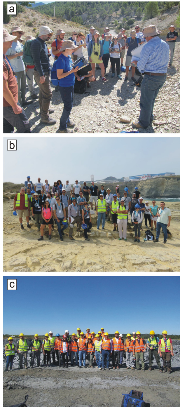
Figure 3. Researchers attending the different excursions to Pliensbachian-Toarcian sections during the three editions of the International Workshop on Toarcian Oceanic Anoxic Event (IW-TOAE) . A. Visit to the Fuente Vidriera section in the Subbetic (Betic Cordillera, South Spain) during the 1 st IW-TOAE (October 2017). B. Visit to the Peniche section in the Lusitanian Basin (Portugal) during the 2 nd IW-TOAE (September 2018). C. Visit to the Dotterhausen Quarry (Swabian Alb, Germany) during the 3 rd IW-TOAE (September, 2019).