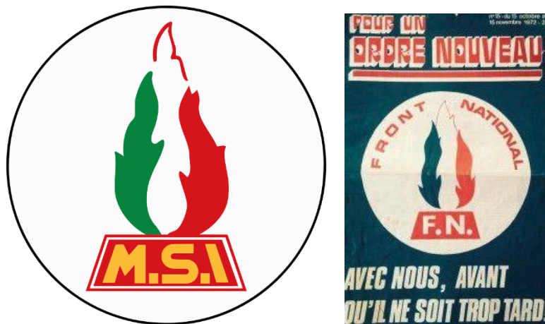
Left: MSI logo from 1947 to 1972; Right: first FN posters in 1972, financed by the MSI