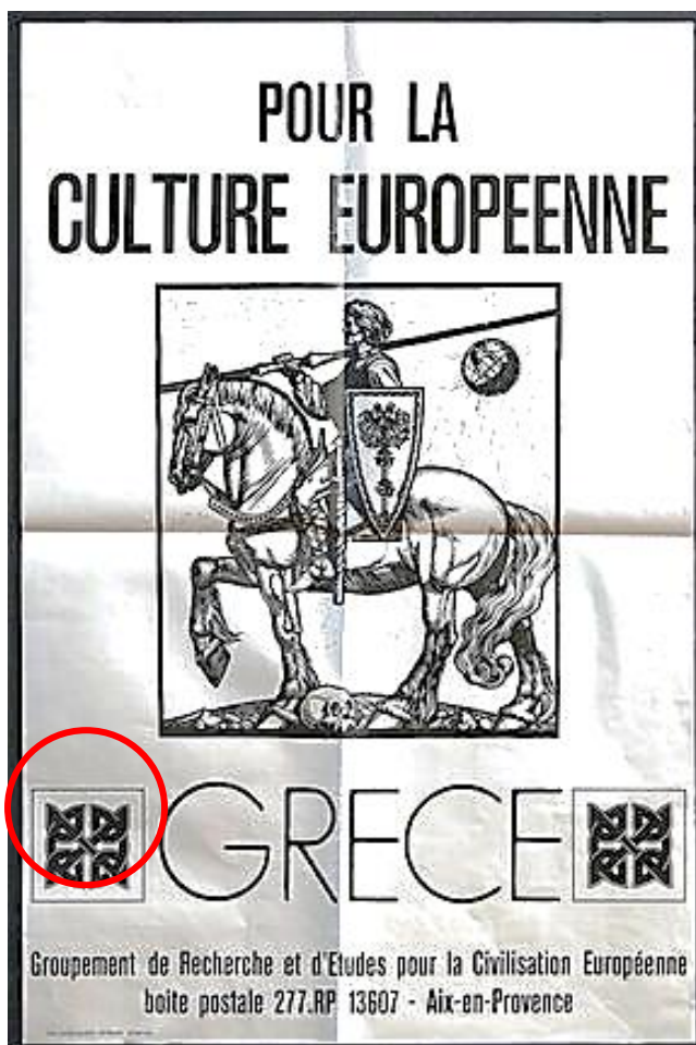
Top left: logo of Azione Studentesca.