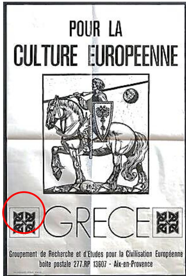
Top left: logo of Azione Studentesca.