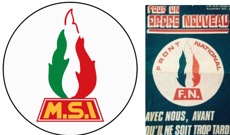
Left: MSI logo from 1947 to 1972; Right: first FN posters in 1972, financed by the MSI