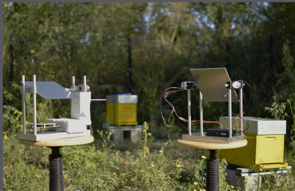
Figure 1: Radar-based tracking system to study bee movements. Left: complete system with radar, support and rotating reflector. Right: system without radar.

having to use tags or transponders. Transmitting the electromagnetic signals in all directions through the fast rotation of a reflector can give information about the azimuth, elevation and range of the target and thus be used for 3D tracking over time (Figure 1).