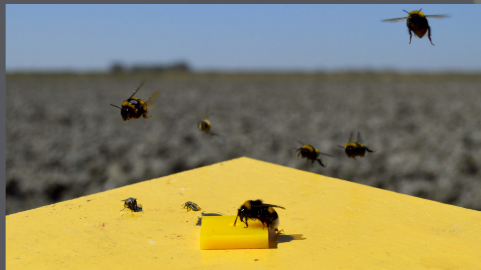
Figure 2: Left: Bumblebees ( Bombus terrestris ) collecting sucrose solution on a feeder in the field. Right: 3D trajectories of bumblebees flying around the feeder. The tracks were obtained with two radars placed on each side of the feeder.