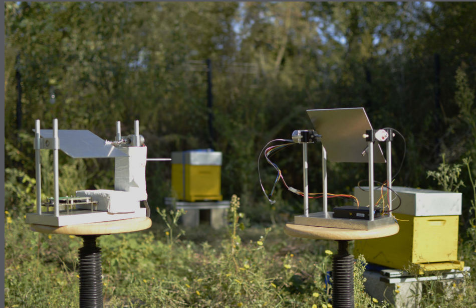
Figure 1: Radar-based tracking system to study bee movements. Left: complete system with radar, support and rotating reflector. Right: system without radar.

having to use tags or transponders. Transmitting the electromagnetic signals in all directions through the fast rotation of a reflector can give information about the azimuth, elevation and range of the target and thus be used for 3D tracking over time (Figure 1).