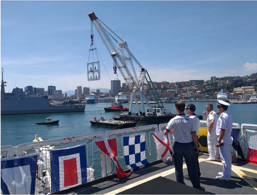
FIG. 3 Preparing the Orizzonti show: the Guard Coast on the Dattilo ship, the Mykonos crane with the acrobats, a tugboat, a mooring boat, ZPGE19.

movement would contribute, highlighted by sound and light, to the creation of the choreography: pilots, moorers, tugs will be co-protagonists of the show [Fig. 2].