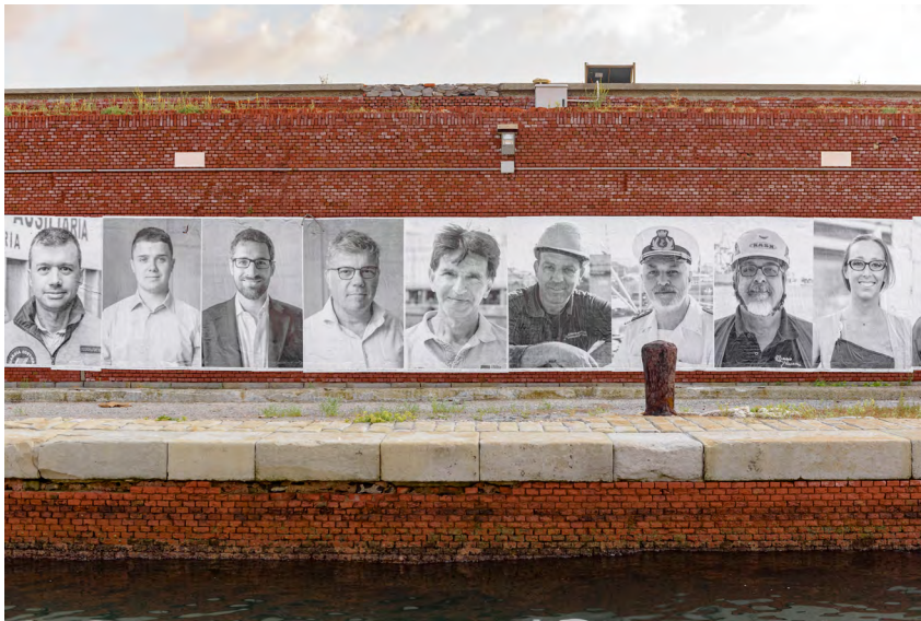
FIG. 1 Inside Out project on the port's dam, ZPGE18

were the occasion for observing the self-displaying discourse port workers made in a public situation, in front of a specific audience: something they never have the opportunity to do otherwise. Moreover, their discourse was directly submitted to questioning and even negotiating, and was forced to adapt depending on the different audiences, often attracted by the artistic proposal itself and hard to be involved without it. This dialogue revealed identitarian representations from both of the sides and moulded new forms of awareness of the port within the audiences: it contributed to develop a port-city culture that a pure scientific and "distant" enquiry would have produced just in theoretical, mediated terms and would not have easily shared with a large audience, even with the best purposes of dissemination.