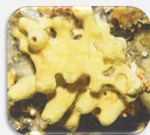
Aplysina cavernicola (Vacelet, 1959)

What is the proportion (diversity & quant.) of specialized metabolites released by A. cavernicola & A. oroides in their surroundings?