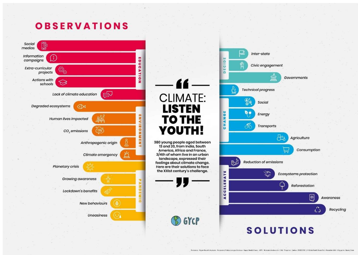
Figure A4. Listen to the Youth.