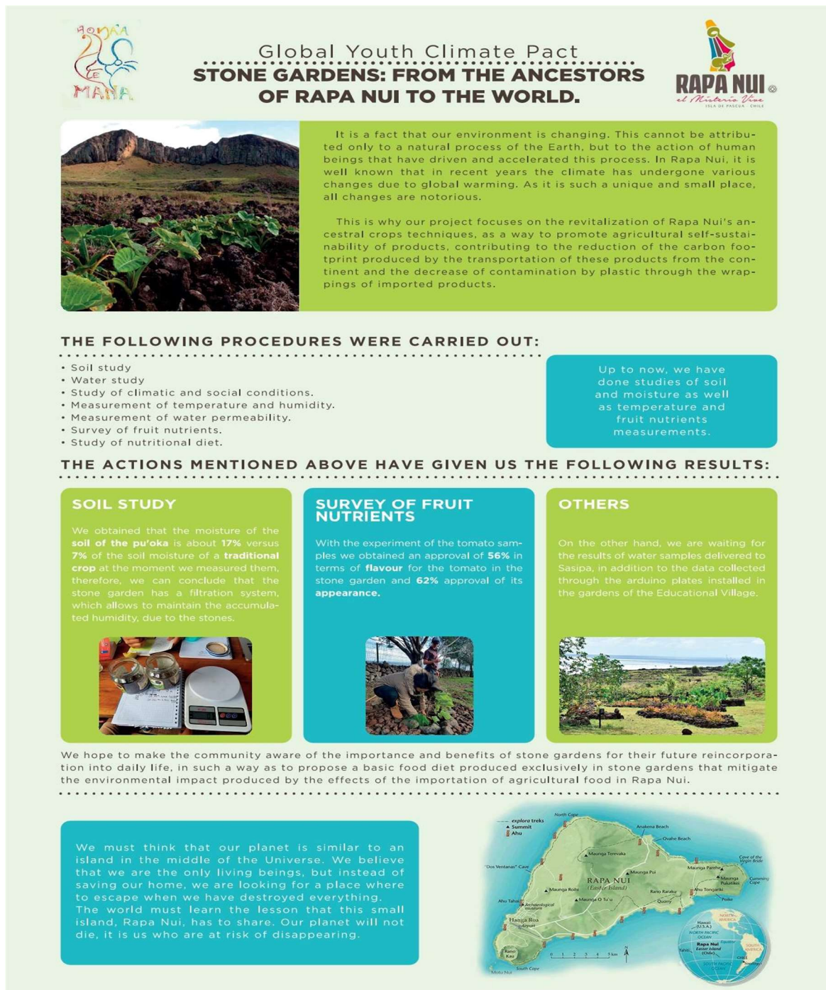
Figure A2. Stone gardens: from the ancestors of Rapa-Nui to the world.