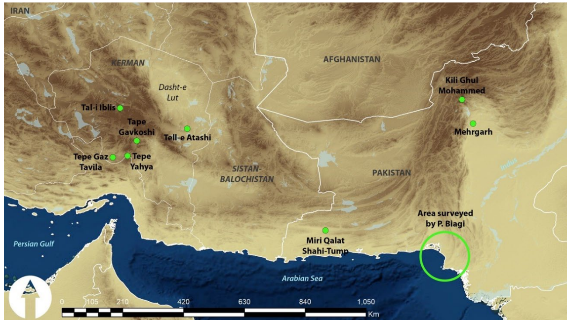
Fig. 1: Map of south-eastern Iran and Pakistan with location of the main sites mentioned in the text.