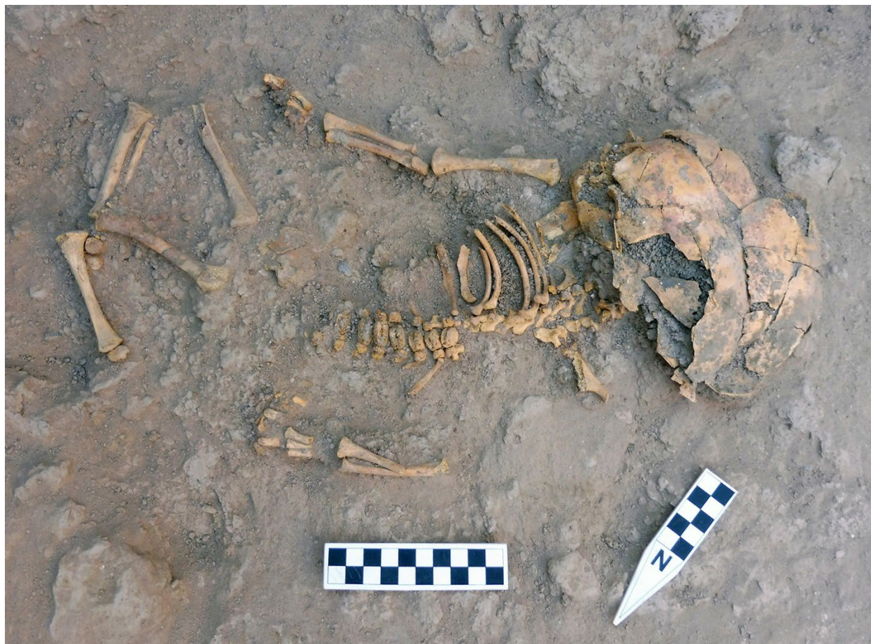
Fig. 7: Burial from Excavation 2 (TT6).