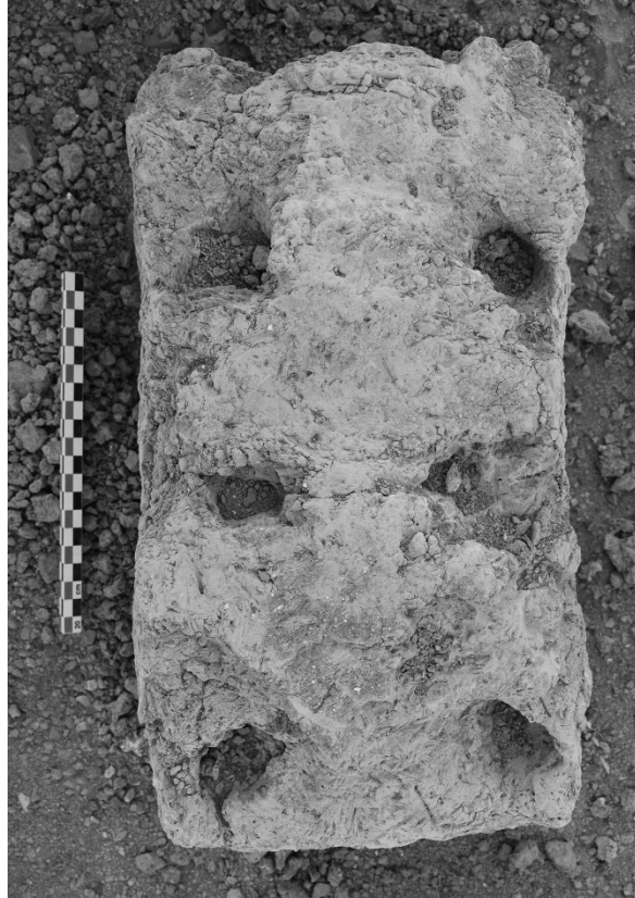
Fig. 4: Mudbrick from Tell-e Atashi, Excavation 2.