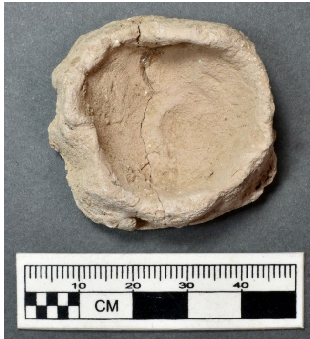
Fig. 5: Unbaked clay miniature dish from Tell-e Atashi, Excavation 2.