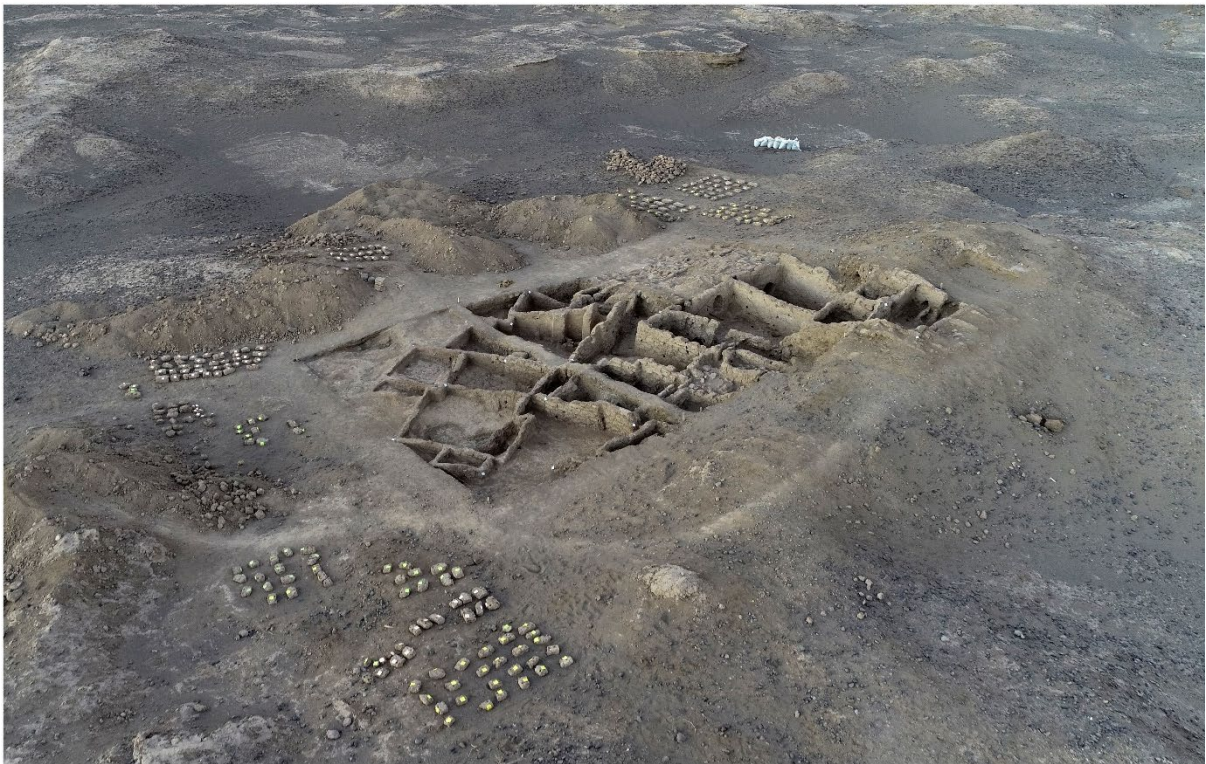
Fig. 3: Views of Excavation 1 (up) and Excavation 2 (down).