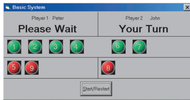
Figure 2: An example of User Interface for the Game of Fifteen

In order for player 2 to know what to select, the activity is rather complex. Player 2 must first perceive the current situation Player 2 might want to try to win (i.e. selecting a token that will still allow player 2 to win) based on the current token selected i.e. token 8. A good choice would be token 3 (projection in the situation awareness framework). Indeed, as number 4 is still available if, after taking 3, player 2 picks number 4, player 2 will win). Another strategy would be to prevent player 1 from winning. In that case player 2 should select token 1. Indeed, as player 1 already has tokens 5 and 9, if (after player 2 has played) player 1 selects token 1, the conditions are met (3 tokens for which the sum equals 15). This complex activity for selecting tokens is complex and would thus be a good candidate for automation. One might think of an algorithm computing all the possible combinations for each player and then proposing the most adequate selection. Automation for the games of fifteen has been studied in [2] highlighting benefits and drawbacks for doing so. Current enthusiasm for artificial intelligence would, for sure, argue that machine learning technologies could provide an adequate solution to the token selection task.