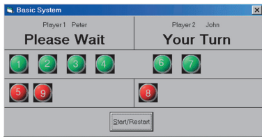
Figure 2: An example of User Interface for the Game of Fifteen

In order for player 2 to know what to select, the activity is rather complex. Player 2 must first perceive the current situation Player 2 might want to try to win (i.e. selecting a token that will still allow player 2 to win) based on the current token selected i.e. token 8. A good choice would be token 3 (projection in the situation awareness framework). Indeed, as number 4 is still available if, after taking 3, player 2 picks number 4, player 2 will win). Another strategy would be to prevent player 1 from winning. In that case player 2 should select token 1. Indeed, as player 1 already has tokens 5 and 9, if (after player 2 has played) player 1 selects token 1, the conditions are met (3 tokens for which the sum equals 15). This complex activity for selecting tokens is complex and would thus be a good candidate for automation. One might think of an algorithm computing all the possible combinations for each player and then proposing the most adequate selection. Automation for the games of fifteen has been studied in [2] highlighting benefits and drawbacks for doing so. Current enthusiasm for artificial intelligence would, for sure, argue that machine learning technologies could provide an adequate solution to the token selection task.