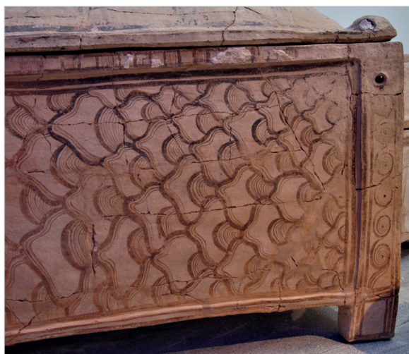
Fig. 1. External wall of an LBA chest larnax from Archanes Phourni (Cat. no. 8), showing the pattern of fractures characteristic of slab-built walls.

The marked evenness and smooth surface could be the result of the pre-forming of slabs, by pressing or flattening. When joined together to build the walls, the slabs would already have had an even surface, so that scraping or regularising operations were unnecessary. Another explanation is the hypothetical use of an external support during the course of manufacture (see below).