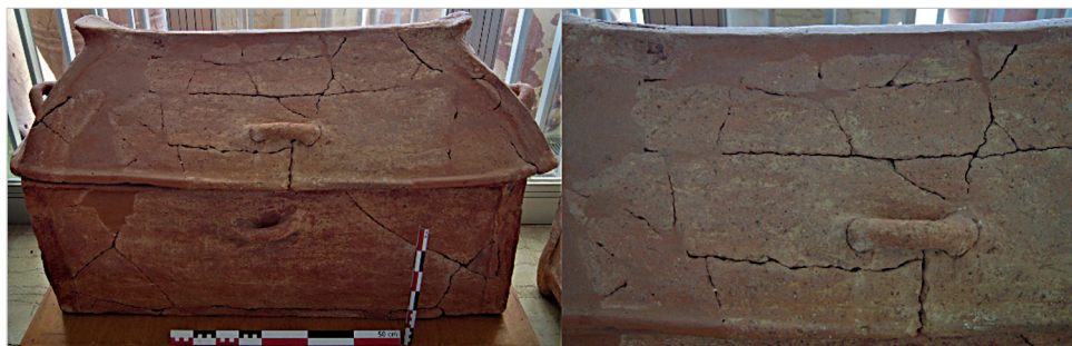
Fig. 4. An LBA chest larnax from Skafa (Cat. no. 14), with a detail of the external wall of its gabled lid showing technological features associated with a coil-built construction technique.

the material, it can be assumed that wood or clay might have been used. The support could have been complete, composed of four individual walls in order to be easily withdrawn after the manufacturing process, or composed of several parts assembled during the forming process, then dismantled.