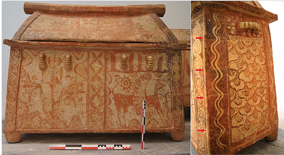
Fig. 2. An LBA chest larnax from Palaikastro (Cat. no. 9), with a detail of the external wall showing the patterning of fractures characteristic of walls built of preformed slabs.