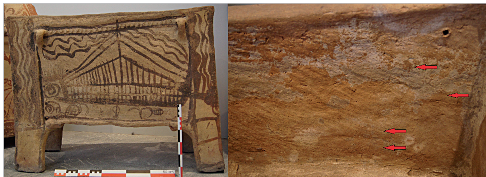
Fig. 3. An LBA chest larnax from Gazi (Cat. no. 4), with a detail of the rhythmic corrugations on the internal wall characteristic of coil-built walls.

characterised by rhythmic corrugations (Fig. 3). In general, long horizontal linear fractures do not appear on these examples, and horizontal junctions are indicated by discontinuous join voids. On some larnakes , step-like fractures can occur. Technological features for the use of secondary forming techniques, such as scraping, are also frequently visible. Abundant elongated fingermarks, revealing that the potter tried to even the inner face of the walls by combing the clay with his hand, have been observed, for instance, on the example shown in Figure 3. Furthermore, these larnakes often show an irregular surface, where smooth areas alternate with rough ones. The corners are usually characterised by an irregular profile and width. On some examples, the lower section of the corners sticks out further than the bottom of the walls, forming a circular protruding area (Cat. nos. 15 and 16).