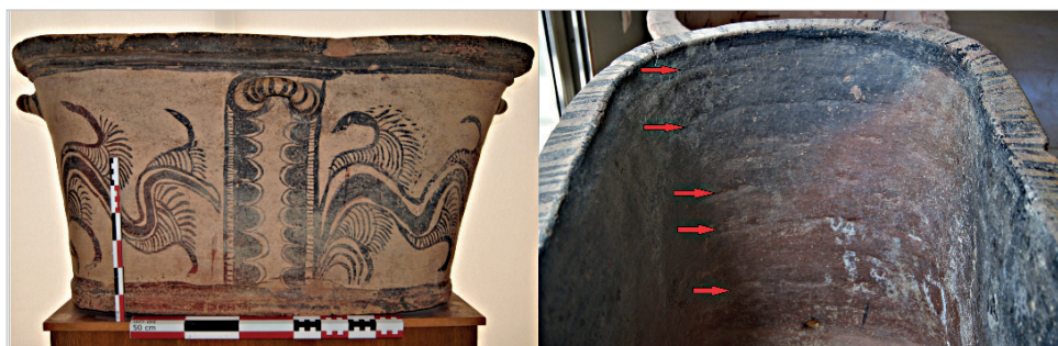
Fig. 6. An LBA bathtub larnax from Mochlos (Cat. no. 19), with a detail of its internal wall showing the rhythmic corrugations and over-thicknesses characteristic of coil-building.

order to join the coils. Scraping operations were performed on the outer and inner faces of the bathtub, in order to increase the height of the coils and regularise the surfaces. The four walls were gradually raised together, from the bottom to the top, as is indicated by the repetition in the location of the horizontal joins, on all four sides. Often, eight to nine levels of large coils can be distinguished, each probably composed of several adjoining coils.