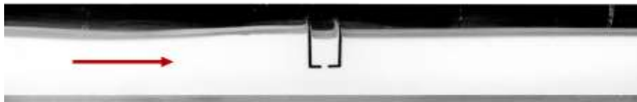
Figure 1: Picture of the experiment showing the resonator geometry. The red arrow indicates the direction of the incident wave.

We present a theoretical and experimental study of a resonator of the Helmholtz type for the wave control. The resonator geometry is presented in figure 1. An experimental demonstration of the shielding effect by a belt made of evenly distributed resonators is given. We then provide in-depth analysis of the Fano resonance resulting from the interference between the dock scattering (the background) and the resonant cavity scattering. This is done thanks to space-time resolved experiments which provides the complex valued scattering coefficients and amplitude within the resonator. We provide a one-dimensional model derived in the shallow water regime owing to asymptotic analysis. The model contains the two ingredients of the Fano resonance and allows us to exhibit the damping due to leakage. When adding heuristically the damping due to losses, it reproduces the main features of the resonance observed experimentally (see figure 2). Those results are reported in Euvé et al. [ J. Fluid Mech 920 , A22 (2021); MDPI crystals 111 , 520 (2021)].