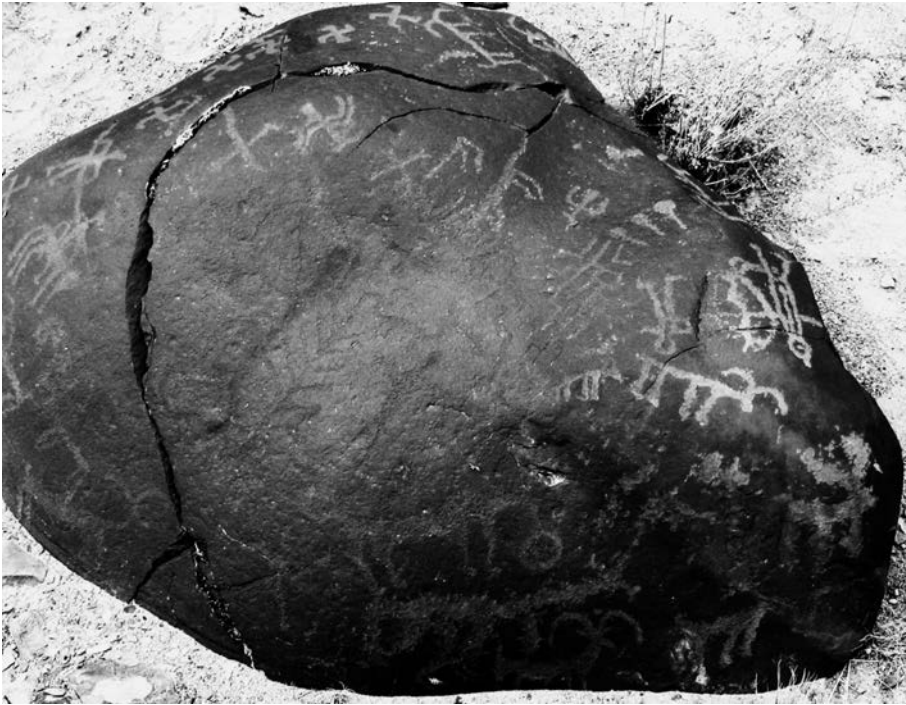
Figure 21.4. Rock engraved with four heron-like birds arranged around a circle, a possible pond or lake (left corner). This group is surrounded by several other images of flying birds and khyungs , Yaru rock art site (Ladakh). (A black-and-white version of this figure will appear in some formats. For the colour version, please refer to the plate section.)

between the seventh and fourth centuries BCE (Francfort et al. , 1990). The association of bird and Ibex is not uncommon in the ‘art of the steppes’, as illustrated by a bronze piece from Kandia (Kohistan, northern Pakistan) representing a crouching Ibex with a bird’s head attached to its horn (Jettmar, 1982). This piece was compared to similar bronzes from the Pamirs and dated to the fifth or third century BCE (Jettmar, 1982; Litvinsky, 1993; Parzinger, 2001). The Kandia plaque seems to have been locally produced because of the crested bird, most probably a Himalayan monal Lophophorus impejanus , a species not encountered in the Pamirs (Jettmar, 2002). We might also mention here a metal piece, acquired in Leh, in the shape of a bird of prey, comparable to pieces from the steppes, but unfortunately, its provenance being unknown, it does not provide much valuable information (Koenig, 1984). We should also mention here the images of four peacocks engraved at the site of Dachi (Dachi/Dartsigs, lower Ladakh), where stags, on the tips of their hooves and with their heads turned backwards, as well as felines with bodies ornamented with volutes and typical of the ‘animal style’ were found engraved nearby.