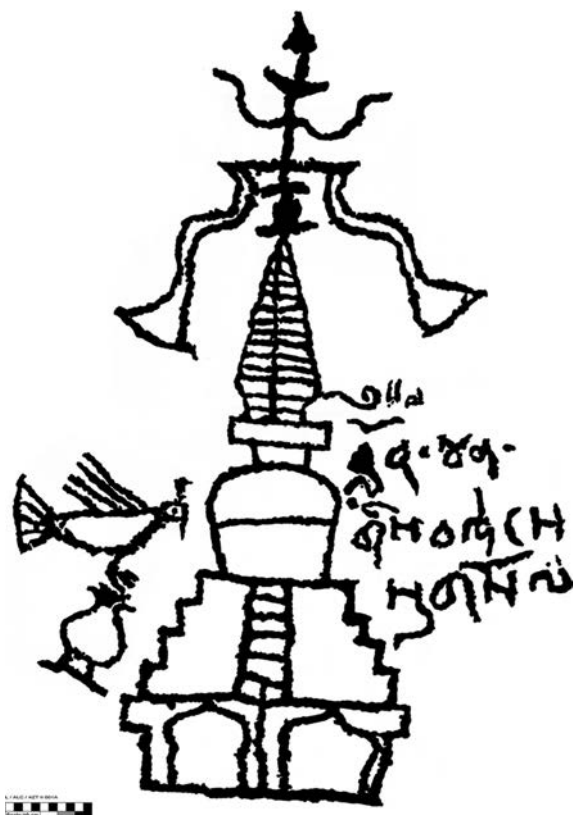
Figure 21.5. A bird holding a vase engraved next to a stūpa and an early Tibetan inscription, Alchi rock art site (Ladakh) (Credit: L. Bruneau & M. Vernier).

above a floral design. This association is found again at the same site with two birds (one peacock and one crested bird) holding the petals of a flower in their toes. We assume a Buddhist context for these bird images based on the fact that many of the petroglyphs at the site of Yaru Bridge are from the historic period and include brāhmī inscriptions (unpublished) as well as the historic composition of an elephant Elephas maximus , Yak and Blue Sheep (for more details about this composition, see Bruneau & Bellezza, 2013). This association (bird/flower) is also encountered at the rock art site at Alchi, where it is indubitably associated with Buddhist stūpa engravings. There, below the carving of a triple stūpa on a common platform, two birds (galliformes or anseriformes) are depicted standing and facing each other on the side of a lotus petal. The identification of the central motif as a lotus is made possible by the identical ornamentation of the stūpa platform. The identification of the lotus ornamentation in the carvings is confirmed by ruined stūpas all over Ladakh with similar decorations plastered on their bases (for a list of such stūpas , see Devers et al. , 2014). Below the stūpa and next to the birds is the representation of a vase, a well-known Buddhist motif.