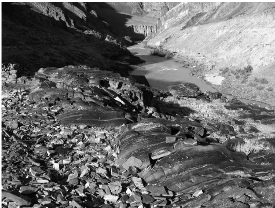
Figure 21.2. View of the Zanskar Gorge upstream of the Zanskar River confluence with the Indus in Ladakh, India. (A black-and-white version of this figure will appear in some formats. For the colour version, please refer to the plate section.)

ranging in colour from dark brown to medium brown, and they demonstrate a skilful engraving technique.