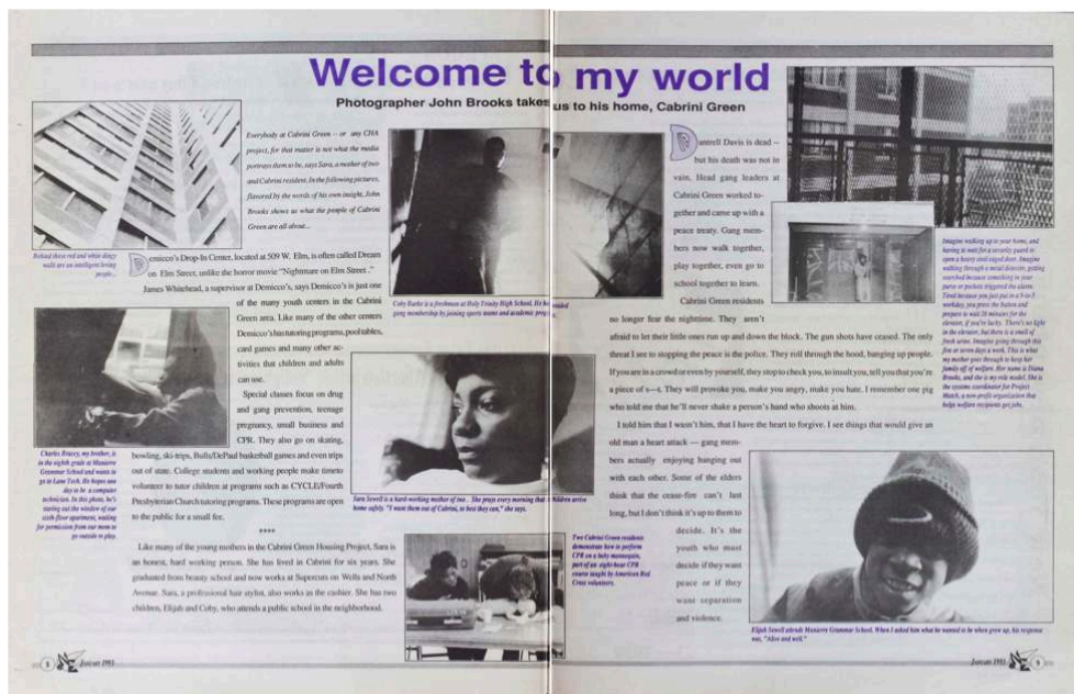
Fig.2: John Brooks, “Welcome to My World,” New Expression , January 1993, 17, no. 1, 8-9. Columbia College Chicago, https://digitalcommons.colum.edu/ycc_newexpressions/130/

18 The title of this section is a quotation from the cover of the January 1993 issue of the Chicago teen magazine New Expression , which featured the images and words of