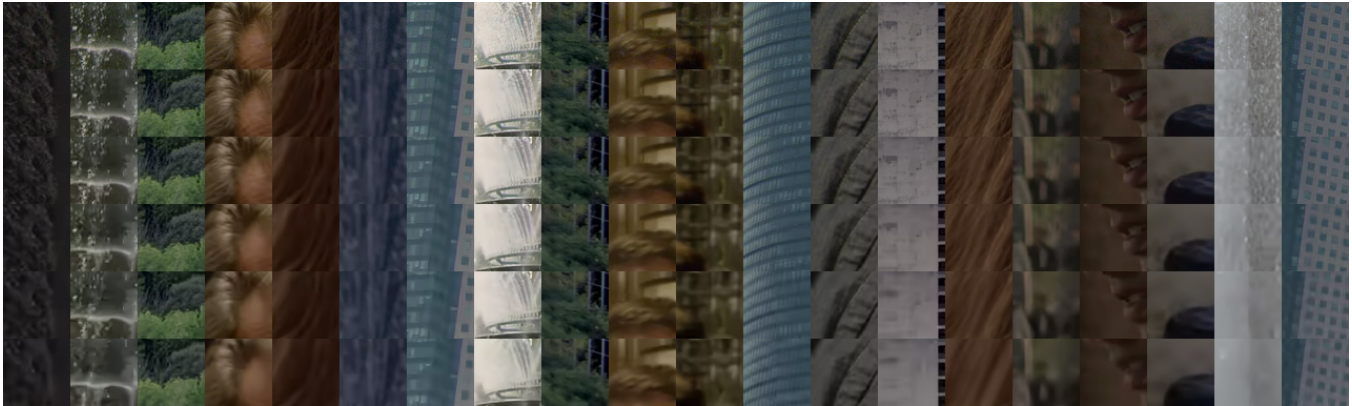
Figure 1: Example of 20 tube-contents selected for the first subjective experiment. Each column represents a tube-content and its distortion levels in increasing order from the top with the original tubes (not distorted) to bottom with the most distorted level.