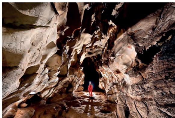
Figure 1: Overview of an asymmetrical gallery marked by biocorrosion. The biogenic lapiaz on the right faces a smooth wall hollowed out with biogenic conches on the left that overlies a notch visible at the foot of the walls. The soil is made up of a thick layer of phosphates from guano mineralization.

Geomorphological studies of caves in tropical areas have shown that the presence of large colonies of bats has an impact on the morphological evolution of galleries (MC FARLANE et al. , 1995; LUNDBERG & MC FARLANE, 2012). Biocorrosion can result in occasional alterations, such as bell holes on the ceiling or pot holes on the ground. They develop around bat nesting areas or under piles of guano but it appears that biocorrosion can also be responsible for larger features manifested on the scale of the entire gallery (Fig. 1). These morphologies are often more difficult to identify, requiring consideration of a whole series of features that are still relatively unknown, the association of which reveals not only the different impacts of biocorrosion, but also the extent of biogenic reshaping. In certain cavities such as the Roquette cave (Gard, France), biocorrosion has erased the initial speleogenic features and radically modified the general section of the gallery.