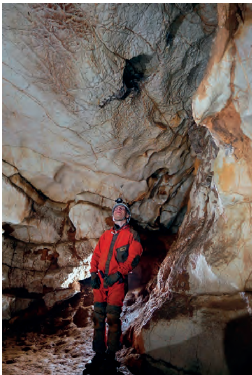
Figure 3: "Elephant skin" appearance of the rock around the bat nesting areas. Here the rock is differentially altered by corrosion condensation made slightly more aggressive thanks to the CO 2 released by bats.

- At the base of the opposite wall , the distal part of the pile of guano causes the formation of a notch, by the leaching of fermentation juices (whose pH can reach 2-3). This develops several decimetres to more than one meter into the limestone (Fig. 2, sections 1 to 5).