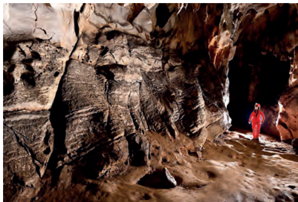
Figure 4: Biogenic lapiaz formed by cryptocorrosion under a guano film. The dark parts (to the left of the personage) correspond to hydroxyapatite crusts.

The association of features and the implied succession of processes are visible all along the cavity. Of course, the asymmetry changes axis depending on the initial position of the top point of the gallery, where the bats have settled (Fig. 2). The wall located under the droppings undergoes a direct alteration, but the guano film and the hydroxyapatite crusts protect it from the acid flows resulting from the fermentation of the main pile of guano (Fig. 4). On this wall,