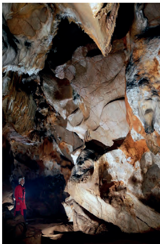
Figure 5: Facing a biogenic lapiaz (on the back of the personage), the limestone wall shows the forms of successive upwelling waves. They cannot be attributed to paragenetic benches and correspond to a stage in the evolution of biogenic conches formed by the convection of acid gases resulting from the fermentation of guano.

we therefore only observe forms of cryptocorrosion (biogenic lapiaz), sometimes pierced with pot holes and the retreat of the wall is moderate. The opposite wall, however, is constantly subjected to the action of acid fluxes resulting from the fermentation of guano. The development of notches at the foot of the opposing walls allows this phenomenon to extend laterally, altering the wall's morphology and accentuating the asymmetry of the gallery.