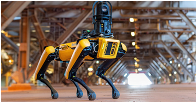
Figure 14.3. Spot®, Bostondynamic's robot dog

acquisition, many solutions have been developed over several years, allowing for object recognition and automatic insertion/prediction of invisible objects (Tang et al. 2010). With the help of 4.0 technologies, professionals are also proposing increasingly innovative means of surveying, which they praise for their performance, ergonomics and accuracy. In addition to digitalizing buildings using drones, Geoslam is now offering the original Zeb Go 16 acquisition process, which can obtain 43,200 points per second. The announced accuracy is +/- 0.1% or 1 cm, and this product only requires a simple movement, camera in hand, inside the building to transcribe the existing into a point cloud. The growing use of tablets is pushing developers to innovate and solutions such as ARtoBuild 17 can now generate 2D plans in PDF format and 3D plans in IFC format from tablets of 10 inches or more.