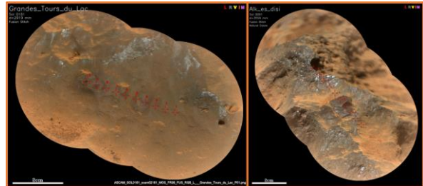
Fig. 4: Sulfate-rich coatings on targets Grandes Tours du Lac and Alk es disi.

Discussion: The detection of perchlorates in Jezero crater confirms that oxychlorine species are widely distributed at the surface of Mars. Previous occurrences of perchlorates were identified in the martian regolith in polar regions (Mg- and Ca-perchlorates detected