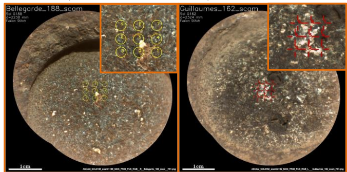
Fig. 1: RMI images of the Bellegarde and Guillaumes abraded patches. Left: FOV of the Raman analyses (notice the white patch in point #5). Right: location of LIBS analyses (notice the mixture of dark and white grains in point #5).

In addition to their direct detection by Raman spectroscopy, salts can also be detected by the LIBS technique. We looked more specifically at the distribution of sulfur and chlorine and at possible correlations with major elements. Hydrogen is also a key element for the identification and characterization of secondary minerals and is discussed in [7]. Finally, the oxygen line can be used to distinguish chlorates or perchlorates from chlorides, or sulfates from sulfides, for instance.