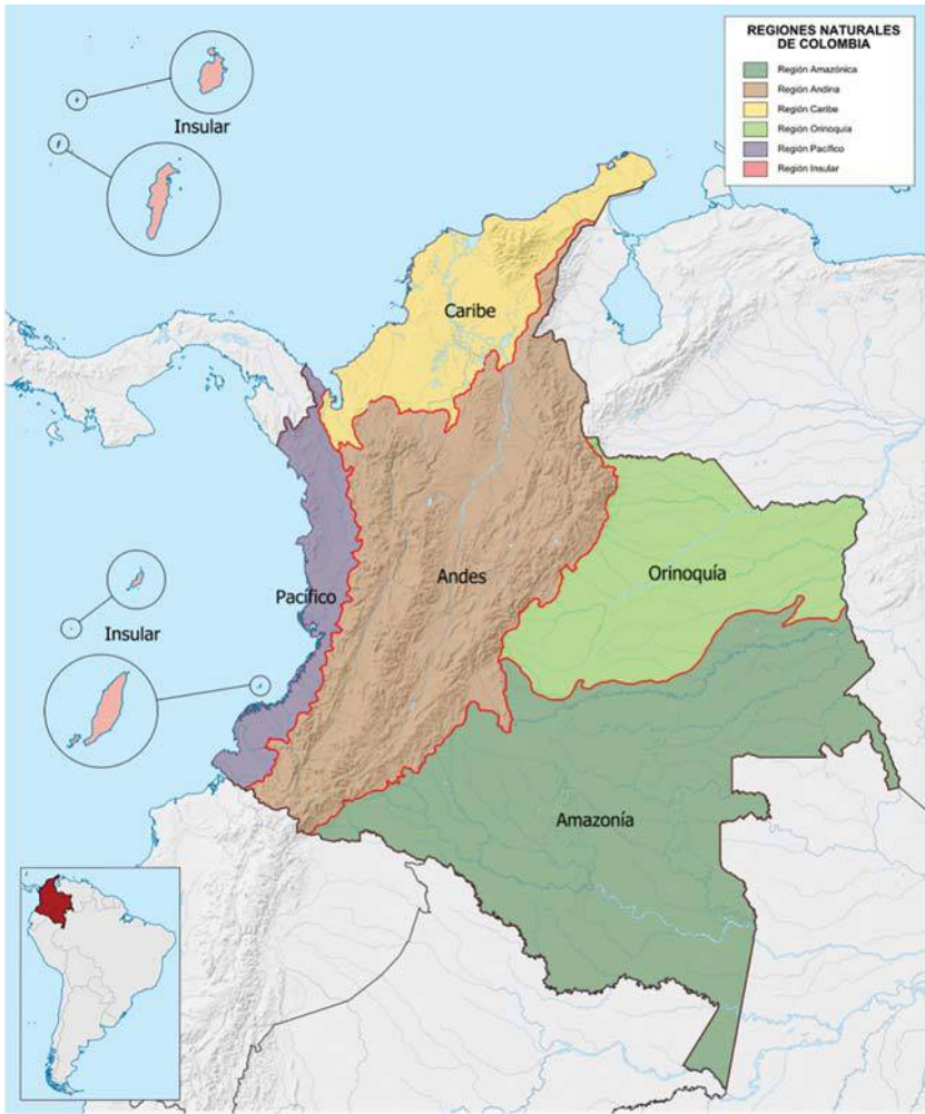
Figure 2. Natural regions of Colombia (adapted from IGAC 2012)

regional contrasts, which we can see were already structured relative to race, must be considered not alone but in addition to the subsequent racial mixing, which did not play out in the same manner in the various regions (Wade 1993, 2020). For example, while the presence of gold mines in the Andean Antioquia region had resulted in the recruitment of slaves in comparable or even higher numbers than those of the Caribbean coast, racial mixing in this region took on such a dimension that the descendants of these slaves are no longer as “visible” in today’s racial landscape: “Thus, for example, the large numbers of black slaves in