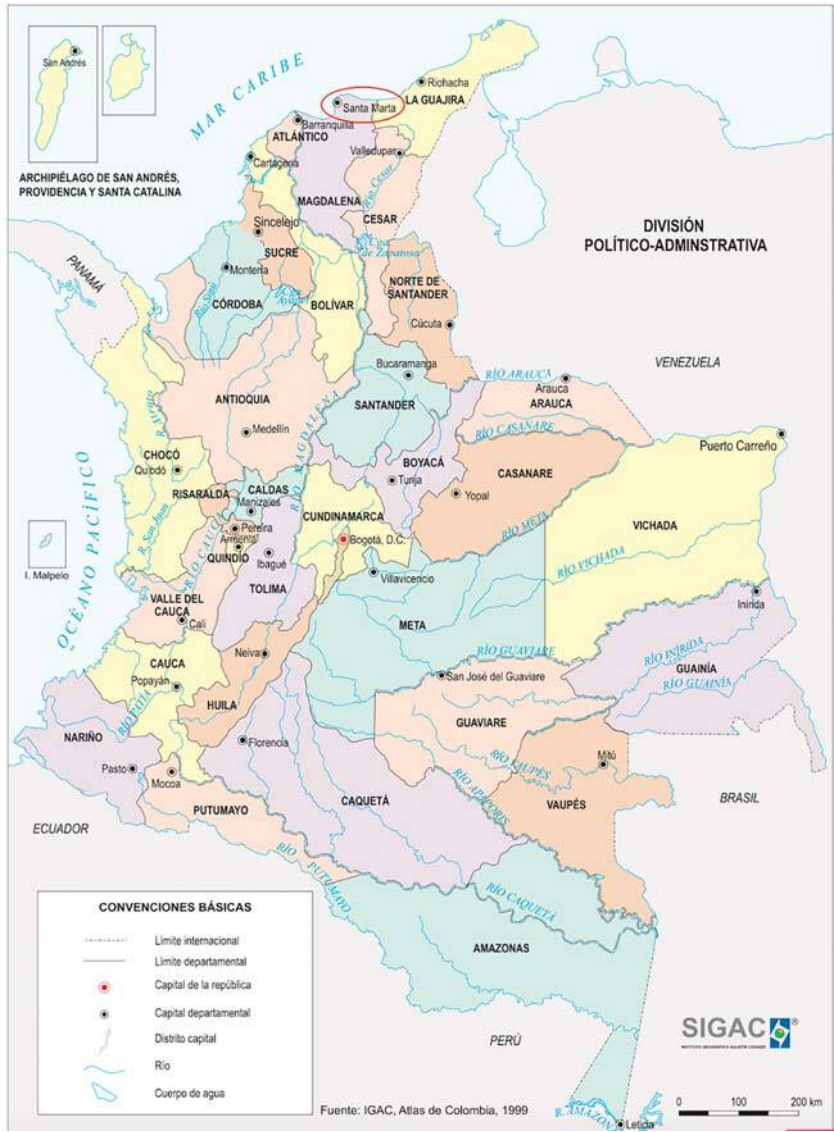
Figure 1. Political map of Colombia (adapted from IGAC 1999)

Africa was gradually and continuously introduced on such a large scale that slavery in Santa Marta came to surpass that of the slave port of Cartagena on several occasions throughout the eighteenth and nineteenth centuries (Bénéï 2011, 116). The migrant waves of the nineteenth and twentieth centuries continued to build this multifaceted landscape: the rise of banana farming in the late nineteenth