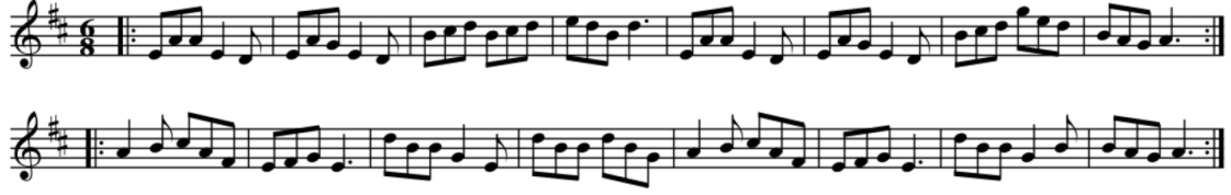
Figure 1: Notation of AI-composed double jig No. 8091 [27].

As a final question, the participant was asked to freely describe any strategies they used to determine whether a tune was composed by a human or a computer.