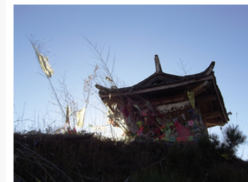
A sanctuary overlooking the plain of Yongning