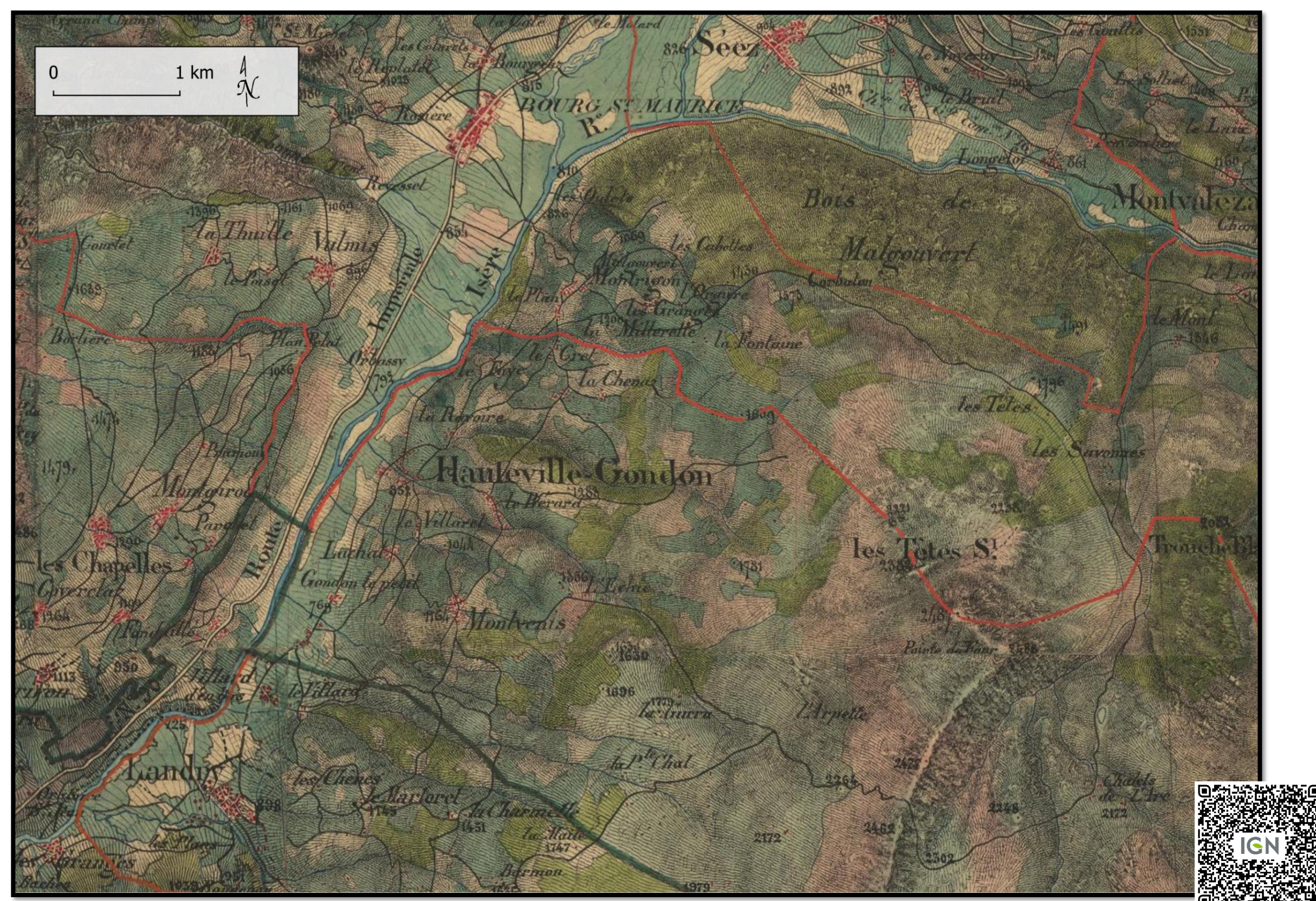
Fig. 1. Historical map drawn during the mid-19 th century (sector of Bourg-Saint-Maurice, Savoie)