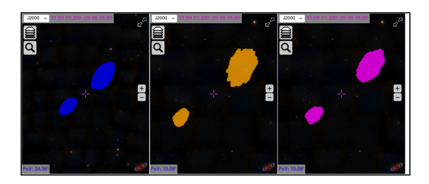
Figure 2. Three synchronized ipyladin widgets to compare the 90% credible region contours of GW190814. From left to right : BAYESTAR (GCN 25324; using data from 3 detectors), LALinference (GCN 25333) and the final sky localization presented in Abbott et al. (2020).

the merger time and the 90% sky-localization credible region, respectively. Using ST-MOC, any operation to search for possible electromagnetic/neutrino counterparts can be computed both in time and in space. Dedicated research can be also performed by choosing a time window around the coalescence time of the compact objects in a binary system.