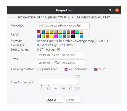
Figure 3. Generation of a ST–MOC from a gravitational-wave sky localization using Aladin Desktop. In the PlaneID box a credible region is selected and in the Time boxes the event's merger time is added. To search for any electromegnetic emissions before or after the compact binary coalescence, the time values can be modified accordingly producing a new ST–MOC.

the huge data release, a fast and real time data access could be provided by encoding the ET sky localizations into ST–MOC and query them from a specific time range. Electromagnetic/neutrino surveys could explore in real time the ET sky localization through multiple spatial and temporal intersections to identify any electromagnetic/neutrino signals temporally and spatially connected to the inspiral, merger or ring-down phases.