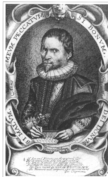
Figure 2: The Delaram engraving

In the twentieth century, however, a strong association has developed between the Trinity College portrait and an engraved portrait by Francis Delaram (1590-1627), shown as Figure 2 above. 2 The engraving is dated 1620, and shows a bearded man with a calculating board such as the Scacchiac Abacus ("Napier's Bones") described by John Napier (1550–1617) in his Rabdologia (Edinburgh, 1617). 3 There are some lines of verse by George Chapman below, but nothing in them to explicitly identify the sitter. Nonetheless, it has been suggested that they are both the same man, viz. the English mathematician Thomas Harriot (c.1560-1621), and the Trinity College portrait so called has been reproduced in several works of biography. 4