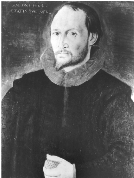
Figure 1: The cleaned portrait to be found in the President's Room of Trinity College, Oxford.