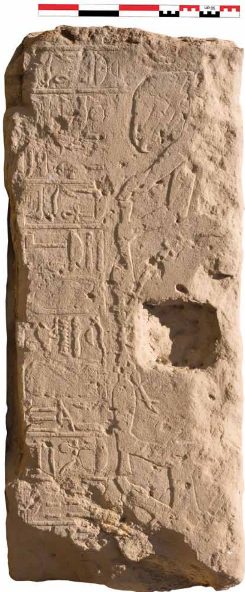
Fig. 26. Loose block of the Eastern colonnade, Karnak