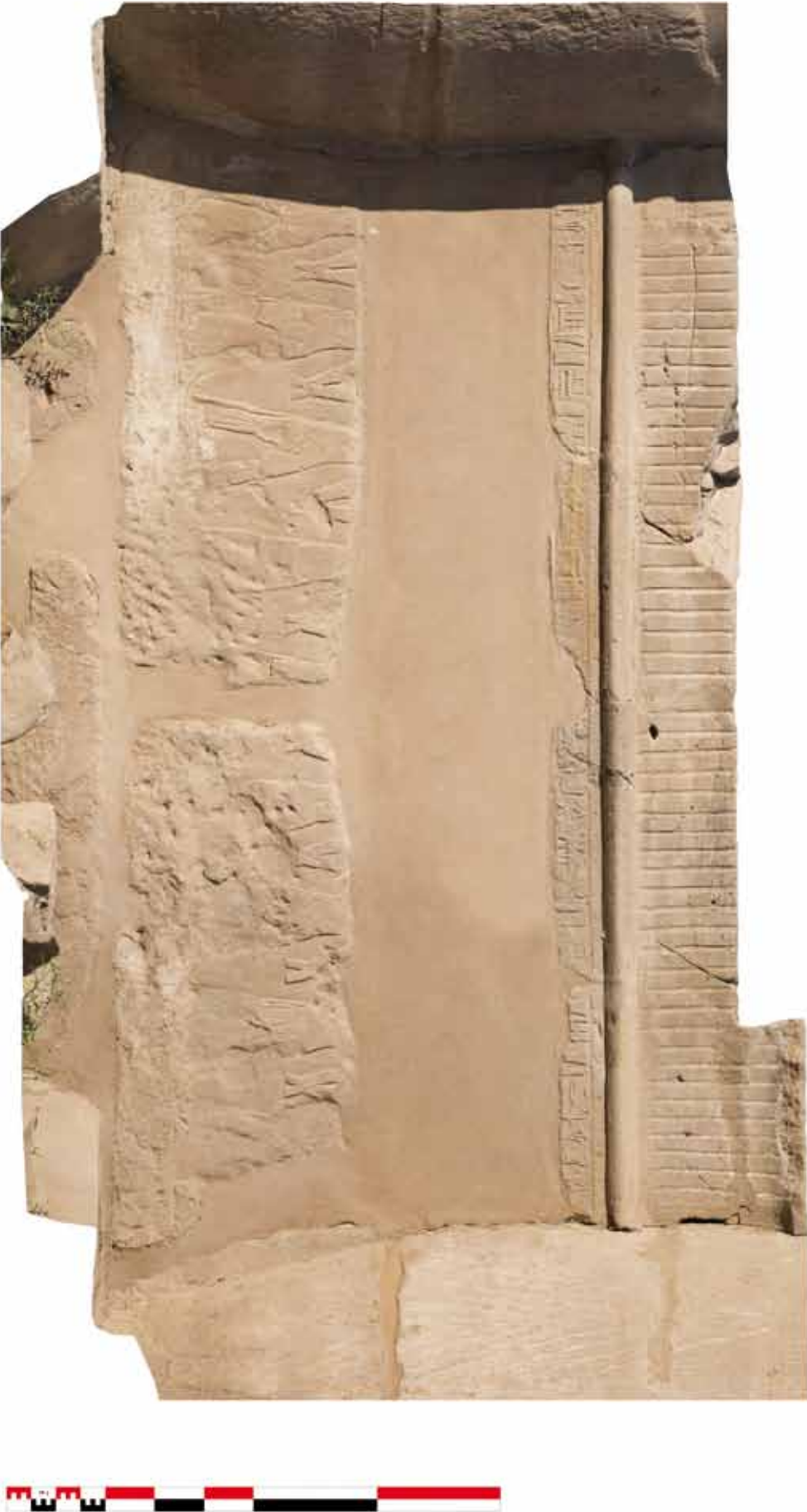
Fig. 31. Eastern colonnade, south way, south side, second screen wall