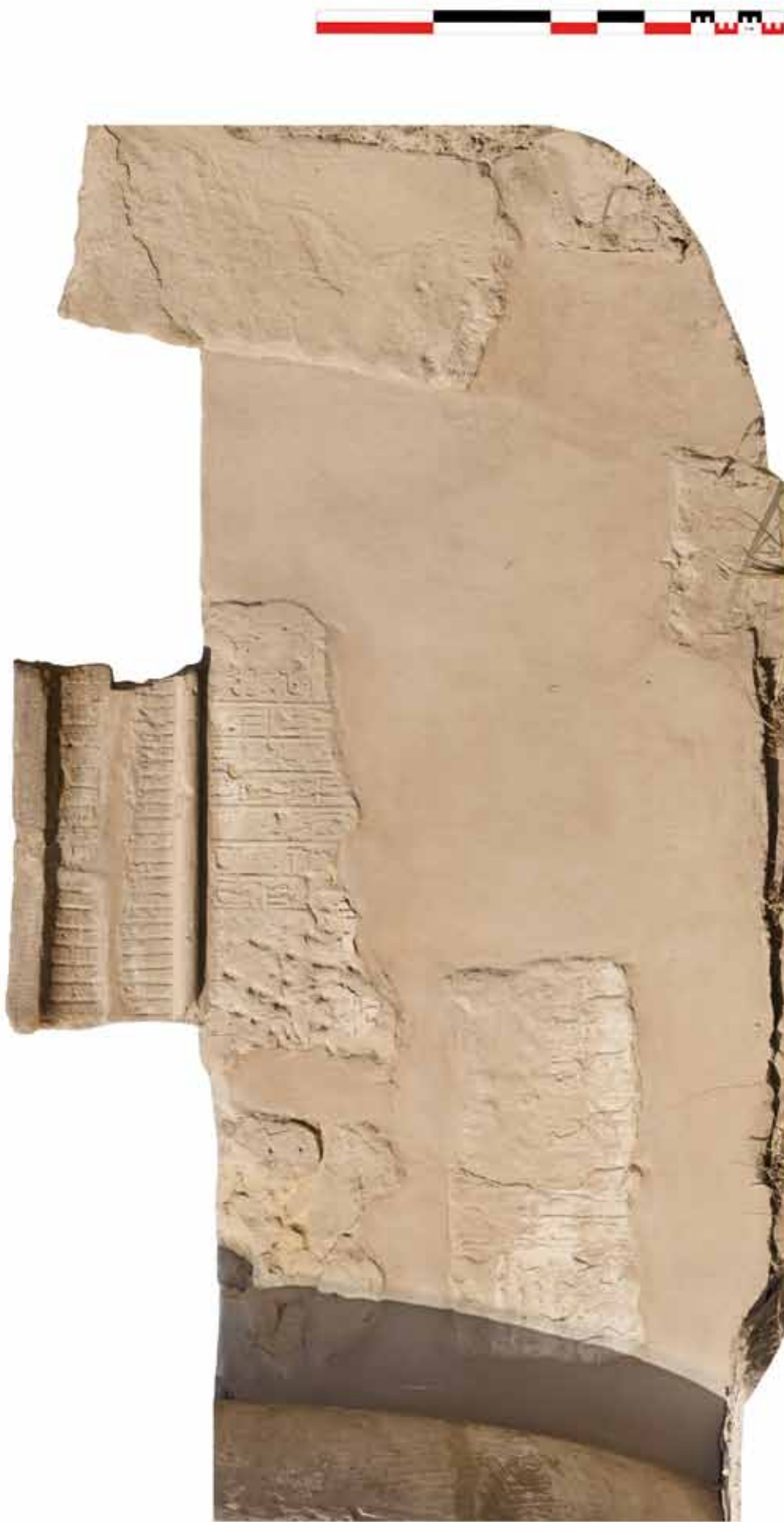
Fig. 30. Eastern colonnade, south way, south side, fifth screen wall