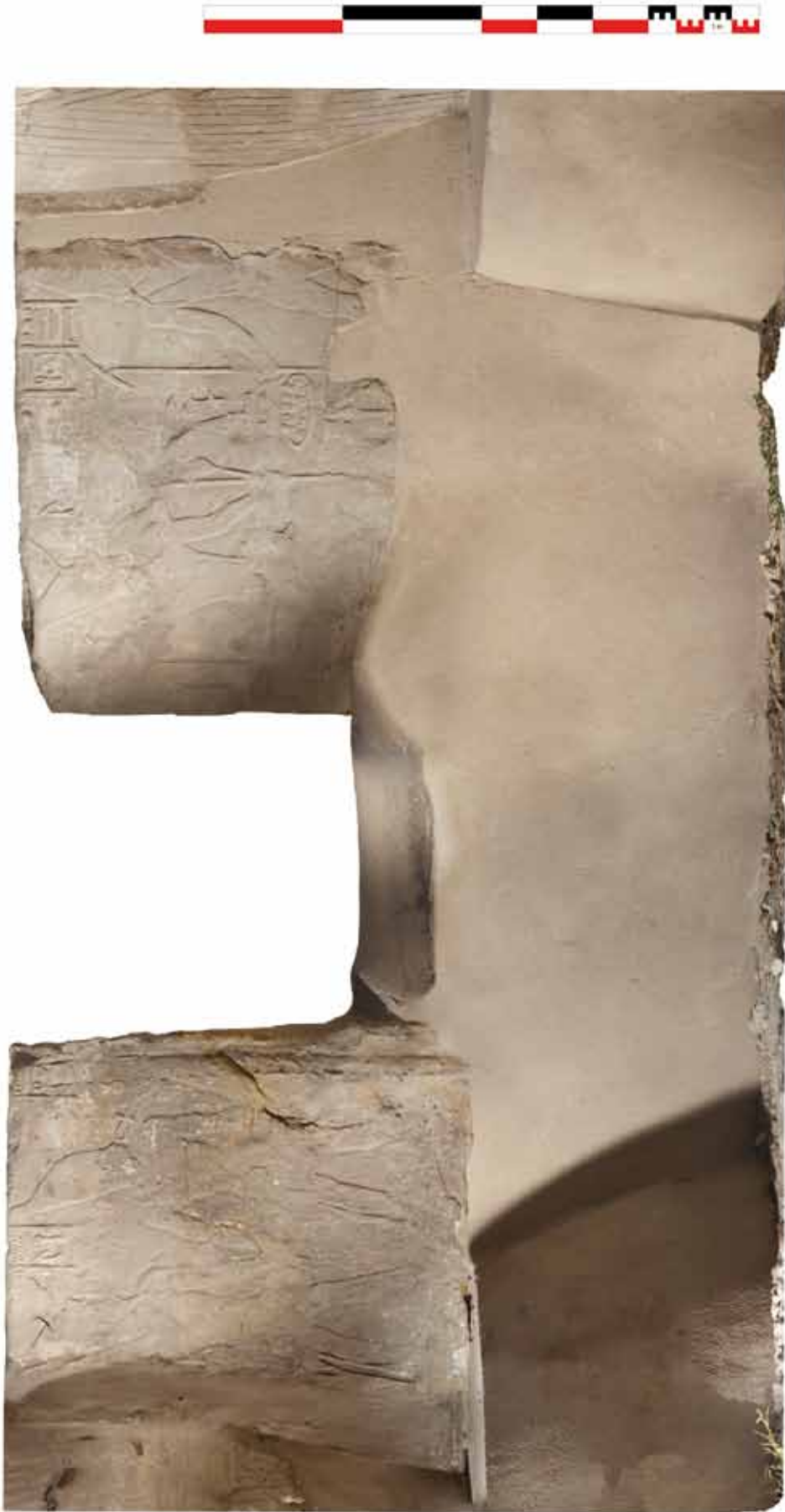
Fig. 28. Eastern colonnade, central way, south side, second screen wall