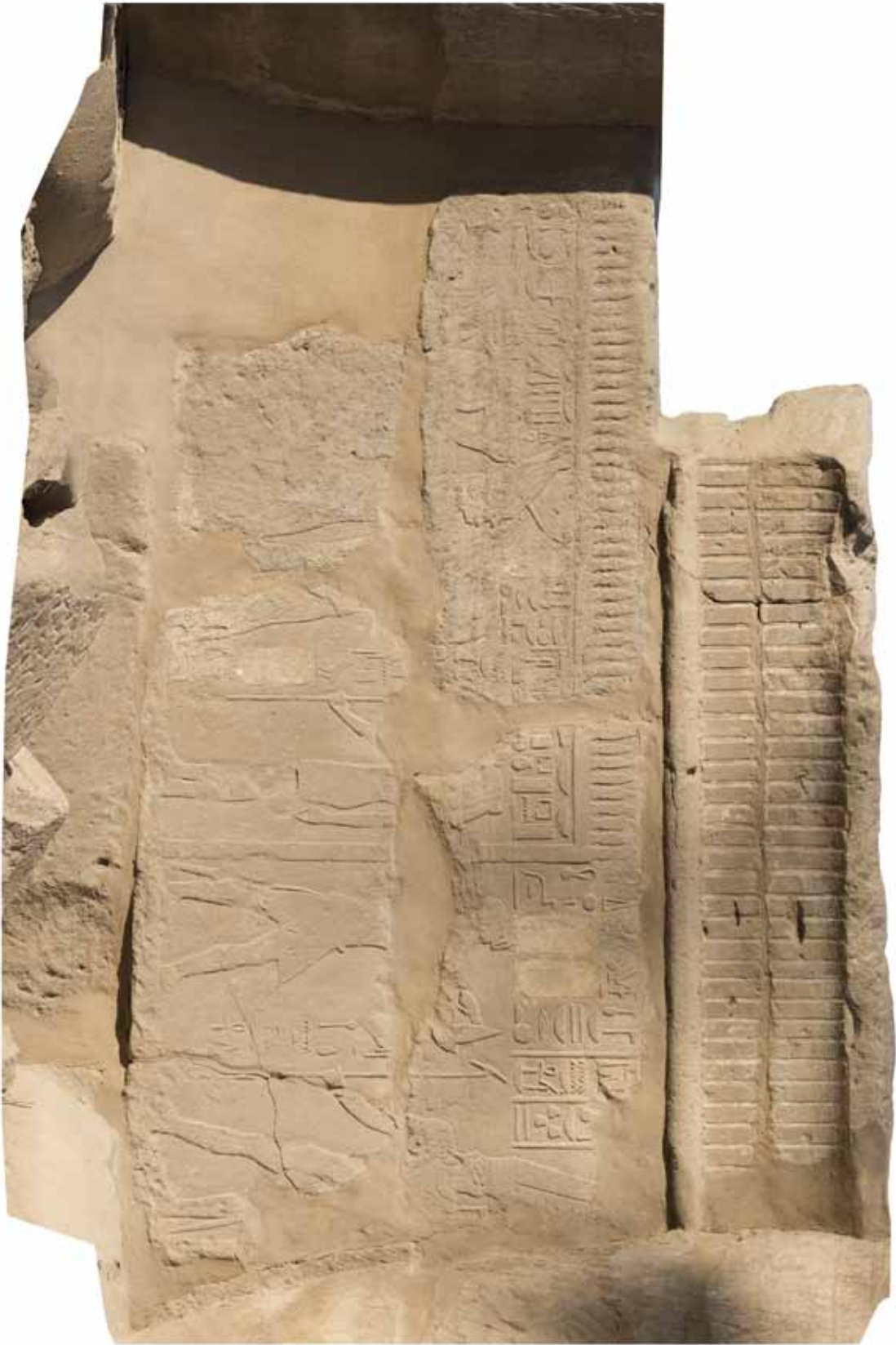
Fig. 29. Eastern colonnade, south way, south side, fourth screen wall