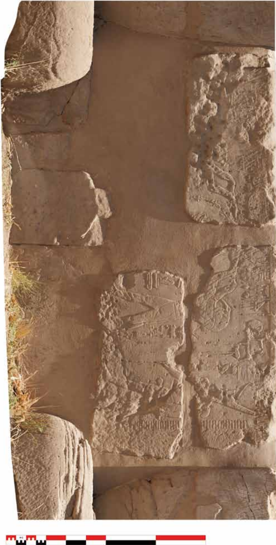
Fig. 25. Eastern colonnade, north way, north side, second screen wall