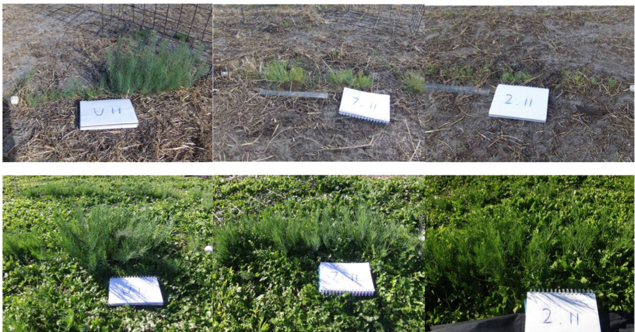
Fig. 2 The upper photographs, taken on 18 April 2014, illustrate the post-grazing appearance of L. ambigua in the un-grazed, moderately grazed and severely grazed treatments of experiment 1 respectively.

1. Means within columns with different superscripts are significantly different. NS, not significant; *** P < 0.001 . LSD is the least significant difference.