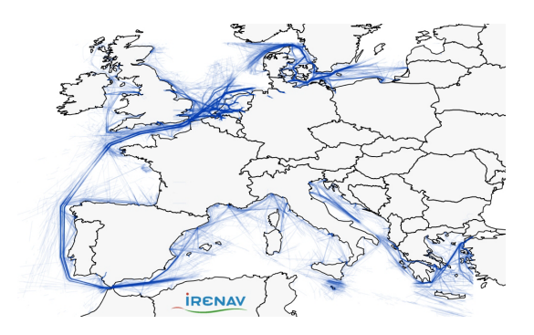
Figure 1: Ships' trajectories, density map in Europe during one month (AIS positions, December 2010)

erated. Detecting trends and abnormal behaviors at sea still require such large-scale continuous collection of vessel positions and the development of specific spatio-temporal analysis and knowledge extraction methods [27].