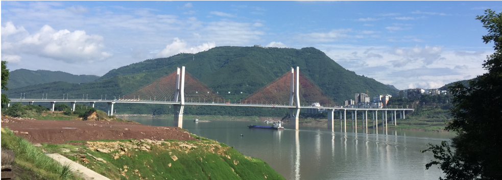
Bridge on the Changjiang River (Yunyang) - Only some locals are aware it is a well-known place for suicide since it was finished in 2005.

Data show that feelings of a space being affected may come from a physical change visible with the naked eye (like a building collapse), or materially measurable (like nuclear contamination). They also can come from an event leaving no tangible trace, such as a site marked by death in the minds of people after a massacre or a suicide. Hence, it seems more appropriate to use the adjective “affected” rather than “changed” or “transformed”. Empirical data also show that people feeling concerned by the change in a space are not limited to the local population. It may even include people who never physically visited the space. This was the case for the Three Gorges landscape and, more recently, when the Cathedral Notre Dame burned in Paris.