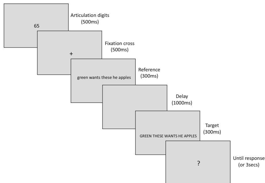
Fig. 1 A typical trial. Participants repeatedly read aloud the two digits (e.g., “six,” “five”) presented at the beginning of the trial for the duration of the trial

models. We then applied signal detection theory (SDT; Macmillan & Creelman, 2005) to analyze discriminability ( d' ) and bias ( c ) in making a “different” response. The statistical analysis of log 10 transformed RTs and error rates was performed with R software (version 3.5.1), separately for “same” and “different” responses using the LME4 library (Bates, Maechler, Bolker, & Walker, 2015), declaring participants and items as random variables. We first tried fully randomized mixed models, including random slopes in addition to random intercepts (Barr, Levy, Scheepers, & Tily, 2013), but in several analyses (for Error Rates on “different” trials and RTs on “different” trials), the analyses failed to converge (that is, no solution was found within a reasonable number of iterations). For consistency, we adopted random intercept-only models for all the analyses. We report b -values, standard errors (SEs), and t -values (for RTs) and z -values (for errors), with t - and z -values beyond |1.96| deemed significant