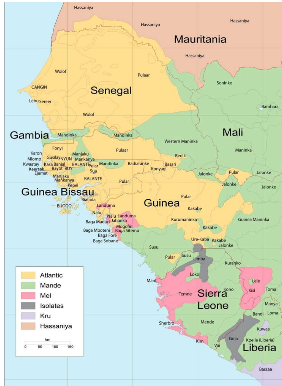
Podzniakov, Segerer & Vydrin 2008)