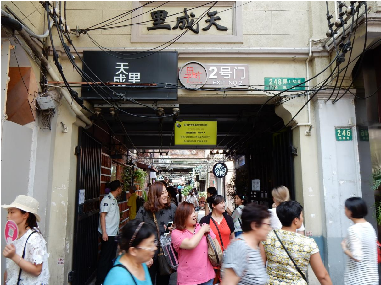
Figure 5: summer 2015