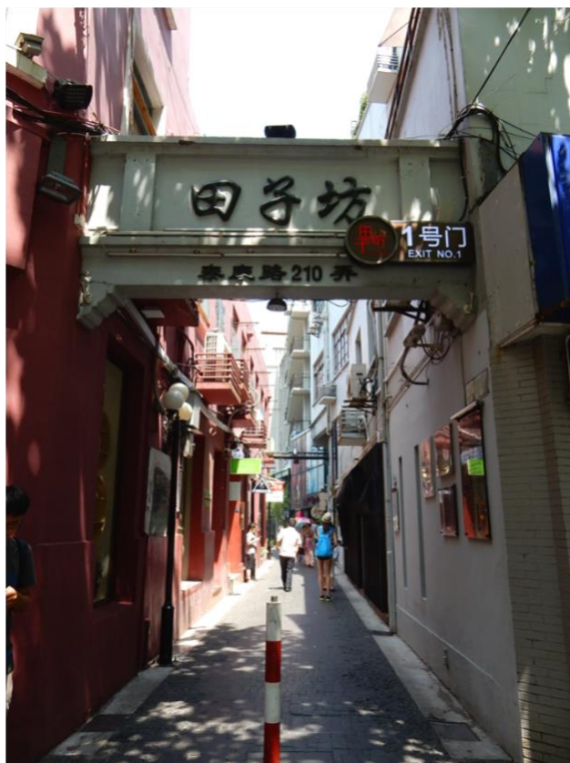
Figure 2: Tianzifang's main entrance 210 Taikang lu

are continuously increasing, and a 40 m 2 apartment in the main aisle can be rented for up to 40,000 Yuan per month. 11