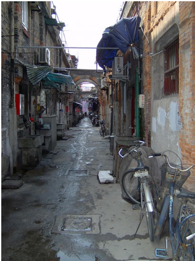
Figure 4: Summer 2006