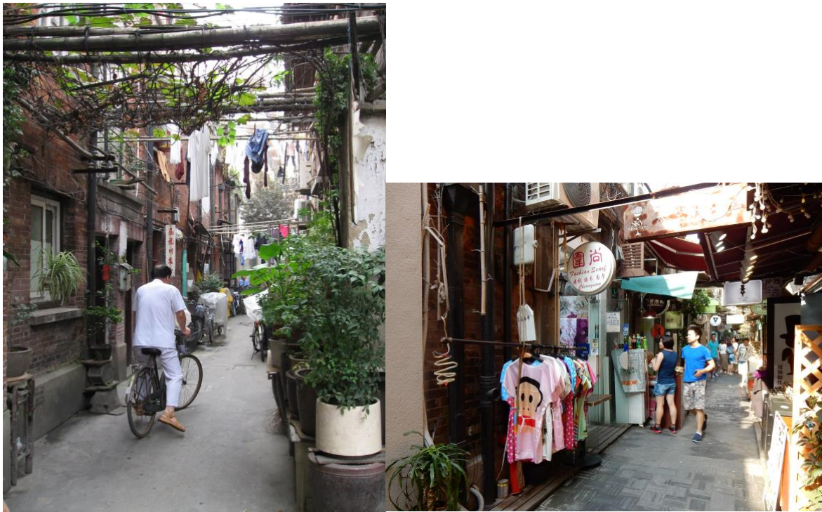
Figure 6 Spring 2005 – Summer 2015