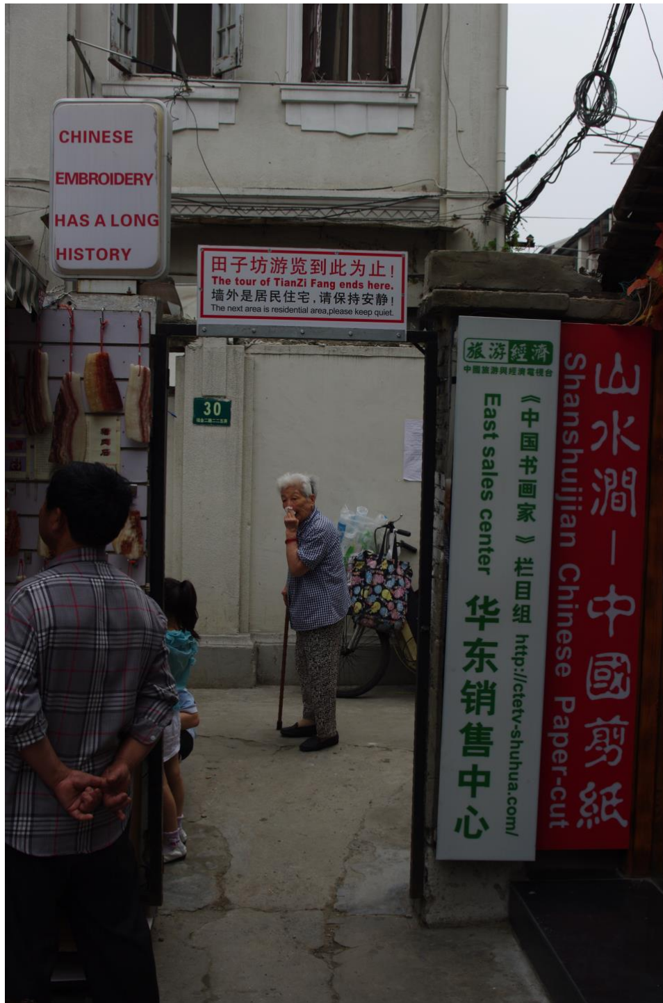
Figure 3 Summer 2010

At the end of 2012, a survey 14 of the tourists visiting Tianzifang commissioned by Luwan district, showed that it was ranked last among the Shanghainese sites. According to the journalist who analysed the reports, visitors complain that there are too many tourists in the narrow alleys. They also complain about inflated prices for average quality goods. As for the