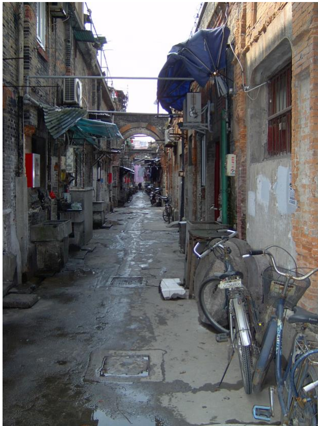
Figure 4: Summer 2006