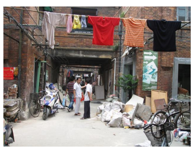
Figure 5b. During renovation