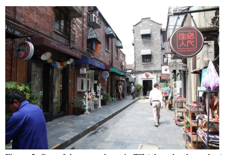
Figure 2. One of the stone doors in TZ

Tianzifang was built during the 1930s, this was the last stage of Lilong construction. It consists of a set of small three-floor buildings made of grey and red bricks and a dozen houses called Shikumen of two to three floors. At first, its size was 7.2 hectares. There was only one lane, but since 2010 the perimeter has expanded westward, incorporating other lilongs under the label TZF. It is now an administrative part of Luwan district, in the southwestern part of Shanghai's city centre. At the time of its construction, it was part of the French concession.