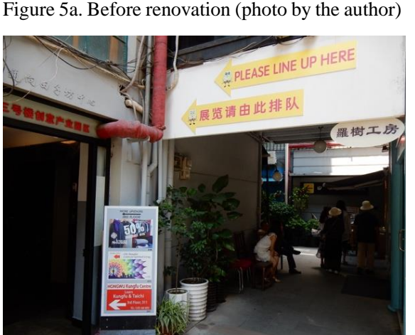
Figure 5c. After renovation