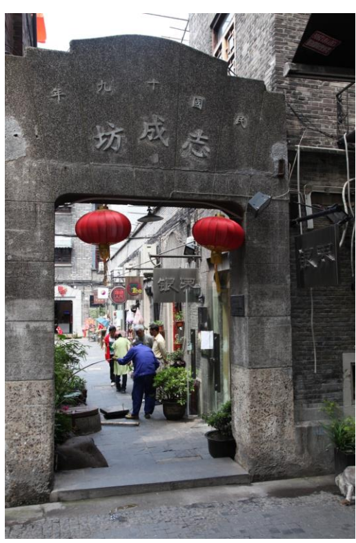
Figure 3. One narrow alley after passing the stone doors – All ground floor dwellings are used as shops.

TZF is crammed in between Jianguo Zhong Road to the north — a relatively narrow one-way street with two lanes, lined with plane trees and usually busy — the small Taikang Road to the south — a one-way street that was not very popular before TZF's success — Ruijin Nan Road to the west — an important thoroughfare (also one-way, with two lanes and plane tree-lined) — and finally the small Sinan Road to the east — also one-way, and comparatively less busy. To the south is Zhaojiabang road, one of the municipality's main thruways with six lanes. It was an old waterway used in the past for the transportation of goods produced in the small factories that bordered it. Now covered, it continues to play an important role in Shanghai's transport system.