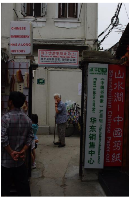
Figure 4. No tourist allowed

The departure of residents has only accelerated since 2000. In 2010 there used to be 670 households living in TZF; now only 80 households remain, most of whom are composed of elderly people. Since 2011, street signs in Chinese and English indicating that visitors are not allowed to penetrate further or that pictures are forbidden beyond a certain limit have started to appear at the end of the shopping alleys. Small booths have been installed at the entrances of the alleys for the security guards on duty;<sup>14</sup> barriers were set up to prevent vehicles and even bicycles from entering.