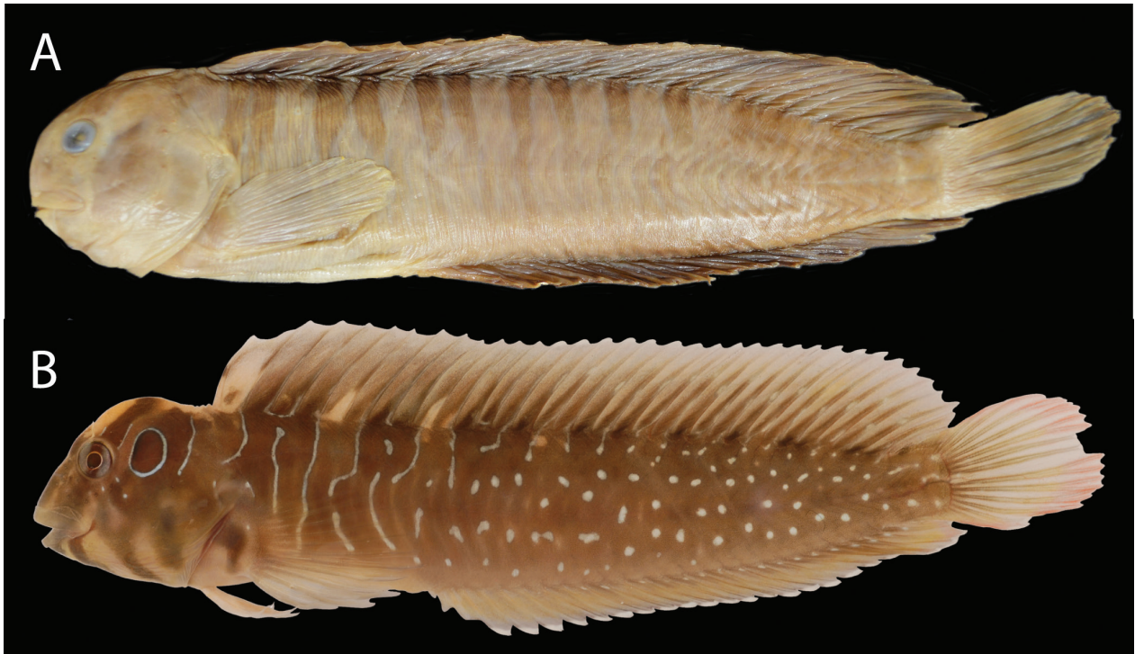
Figure 2. Lateral view of Salaria spp.: S. basilisca, MNHN-IC-A-1779, syntype, 138 mm SL, Italy: Mediterranean Sea at Genoa ( A ;); S. pavo, MNHN-IC-2012-0254, 74 mm SL, Balearic Islands at Menorca ( B ;).

anal-fin soft rays (vs. 20–28); 34–38 vertebrae (vs. 38–44); 8–9 circumorbital pores (vs. 6–7); 8–11 preopercular pores (vs. 6–8); 3 supratemporal pores (vs. 2) (Table 1).