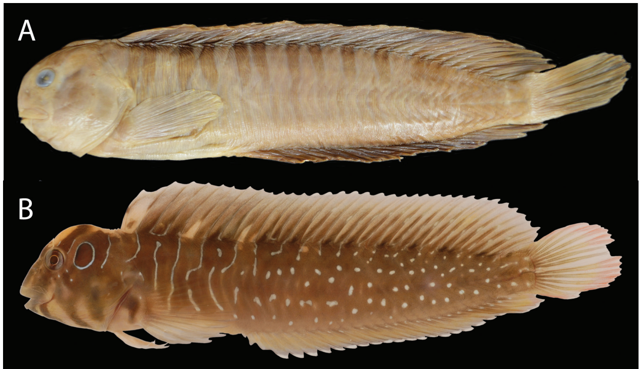
Figure 2. Lateral view of Salaria spp.: S. basilisca, MNHN-IC-A-1779, syntype, 138 mm SL, Italy: Mediterranean Sea at Genoa ( A ;); S. pavo, MNHN-IC-2012-0254, 74 mm SL, Balearic Islands at Menorca ( B ;).