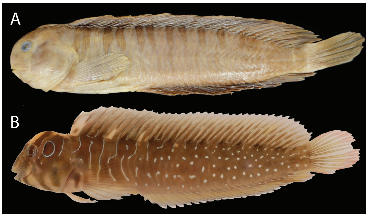
Figure 2. Lateral view of Salaria spp.: S. basilisca, MNHN-IC-A-1779, syntype, 138 mm SL, Italy: Mediterranean Sea at Genoa ( A ;); S. pavo, MNHN-IC-2012-0254, 74 mm SL, Balearic Islands at Menorca ( B ;).

anal-fin soft rays (vs. 20–28); 34–38 vertebrae (vs. 38–44); 8–9 circumorbital pores (vs. 6–7); 8–11 preopercular pores (vs. 6–8); 3 supratemporal pores (vs. 2) (Table 1).