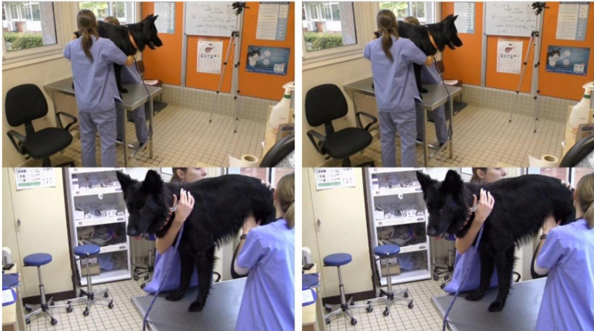
881 Figure 1