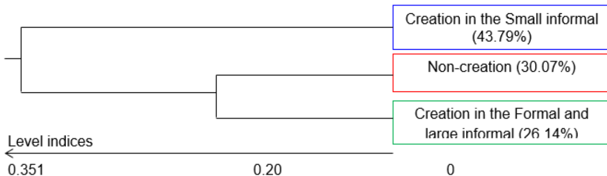
FIGURE 2 HIERARCHICAL TREE OF ENTREPRENEURS AND NON-ENTREPRENEURS ACCORDING TO THEIR SIGNAGE

The dendrogram in Figure 2 represents the hierarchical tree of the three groups of women according to their signage. Table A5 in the Appendix summarizes the main results of the statistical characterization of the groups.