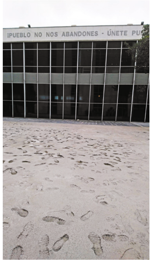
FIGURES 11.3 AND 11.4 The Absence Monument by Yael Bartana in the Tlatelolco University Cultural Centre's central courtyard.

© SABRINA MELENOTTE, MEXICO CITY, OCTOBER 2018