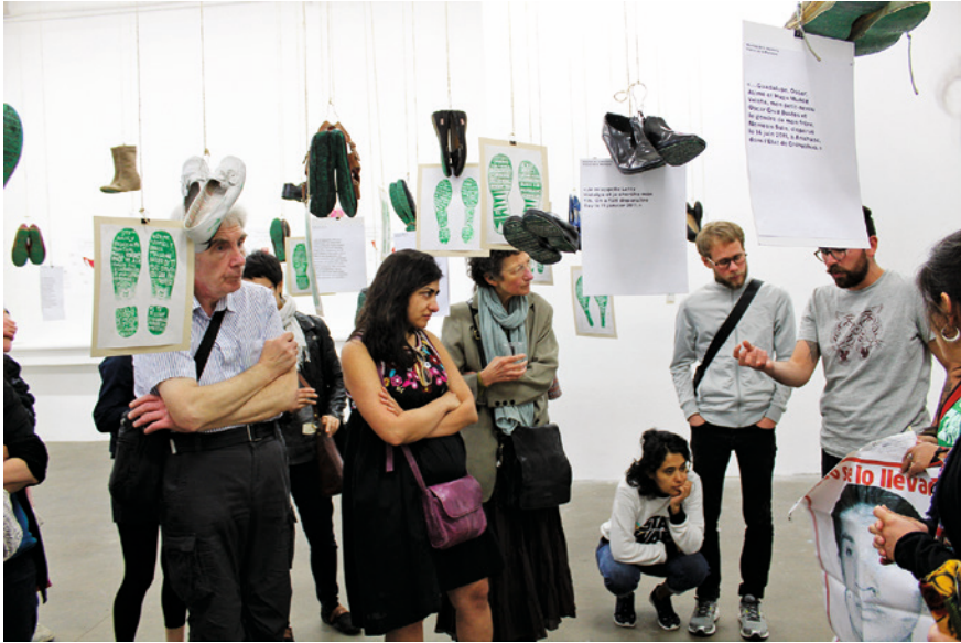
FIGURE 11.11 Exhibition Footprints of Memory.