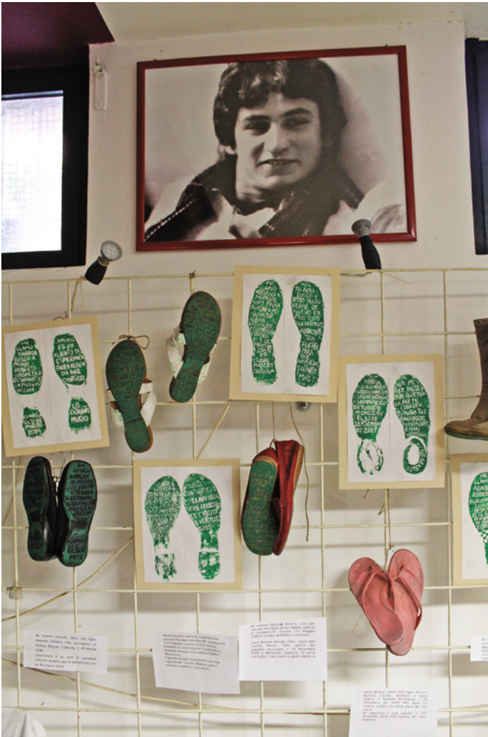
FIGURES 11.12–11.14 Exhibition Footprints of Memory.