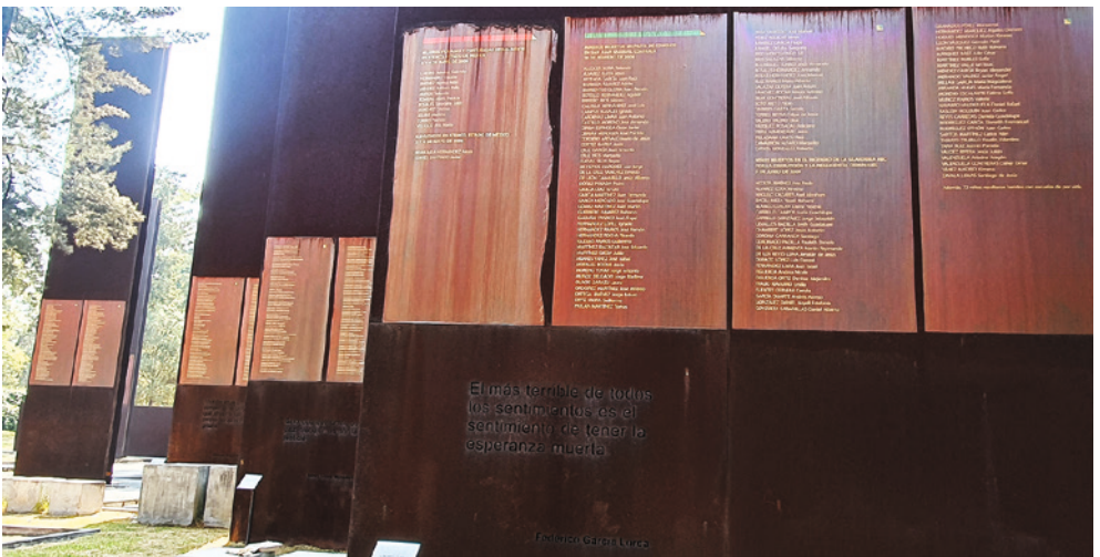
FIGURE 11.2 Memorial to the Victims of Violence in Mexico, with the names of victims attached by a group of victims' organizations led by Comité 68.

has also caused outrage. Above all, however, both the MPJD, led by Javier Sicilia, and victims' organizations as a whole, have condemned it because of the absence of any victims' names or information panels, which is most unusual for a memorial. As with the Holocaust Memorial in Berlin, which also