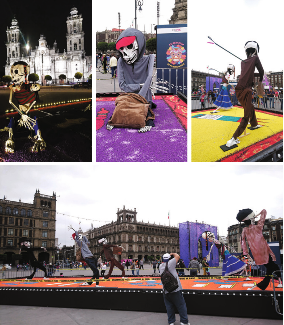
FIGURES 11.5–11.8 Several altars placed in the Zócalo for the Day of the Dead in 2018, representing migrants with five enormous and stereotypical skeletons, known as Catrin as.

© SABRINA MELENOTTE, MEXICO CITY, OCTOBER 2018