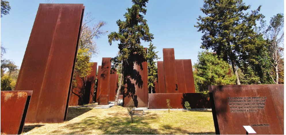
FIGURE 11.1 Memorial to the Victims of Violence in Mexico by Gaeta Springall Architects. © SABRINA MELENOTTE, MEXICO CITY, DECEMBER 2021