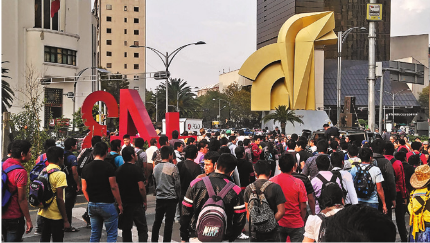
FIGURE 11.10 The anti-monument in Mexico with protesters.

© SABRINA MELENOTTE, MEXICO CITY, OCTOBER 2018