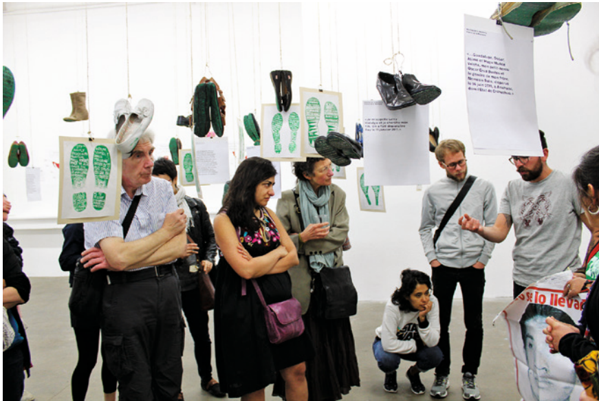
FIGURE 11.11 Exhibition Footprints of Memory.