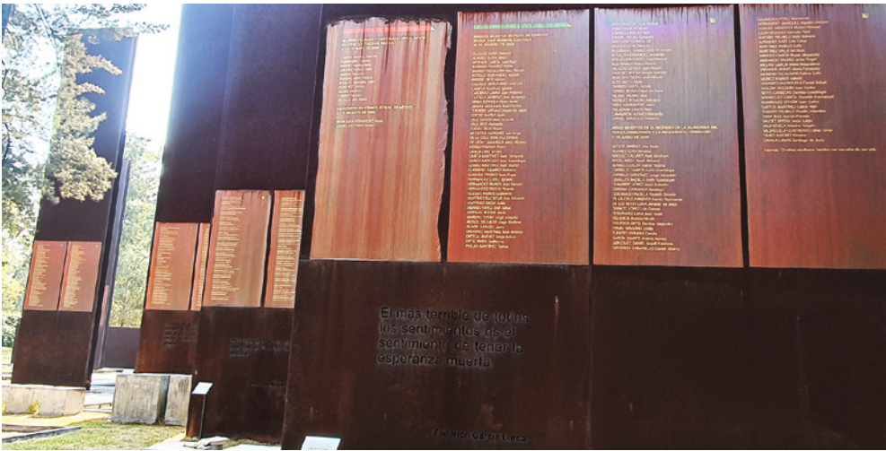
FIGURE 11.2 Memorial to the Victims of Violence in Mexico, with the names of victims attached by a group of victims' organizations led by Comité 68.

has also caused outrage. Above all, however, both the MPJD, led by Javier Sicilia, and victims' organizations as a whole, have condemned it because of the absence of any victims' names or information panels, which is most unusual for a memorial. As with the Holocaust Memorial in Berlin, which also