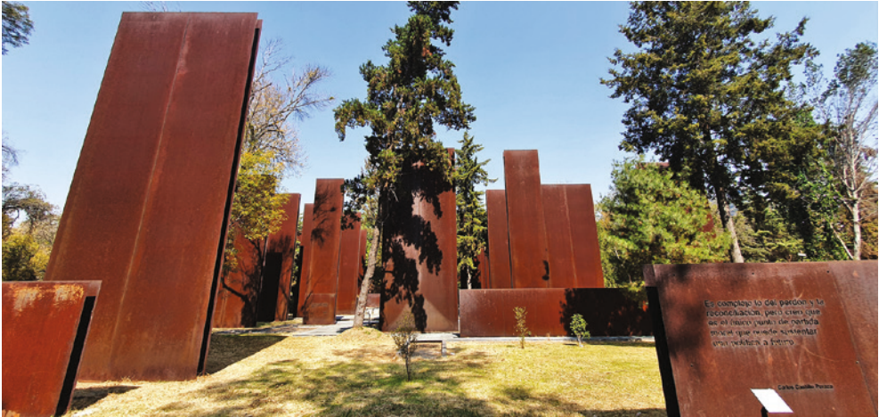
FIGURE 11.1 Memorial to the Victims of Violence in Mexico by Gaeta Springall Architects. © SABRINA MELENOTTE, MEXICO CITY, DECEMBER 2021