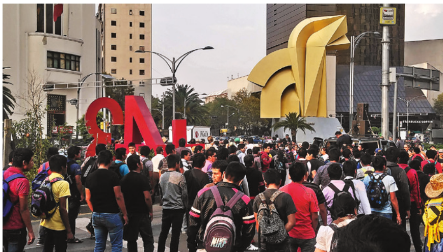
FIGURE 11.10 The anti-monument in Mexico with protesters.

© SABRINA MELENOTTE, MEXICO CITY, OCTOBER 2018