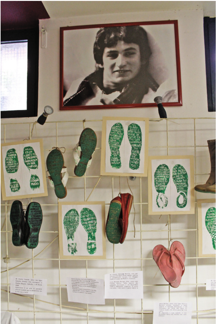
FIGURES 11.12–11.14 Exhibition Footprints of Memory.