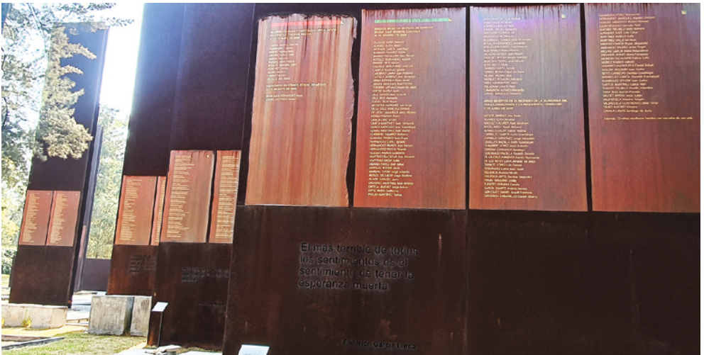
FIGURE 11.2 Memorial to the Victims of Violence in Mexico, with the names of victims attached by a group of victims' organizations led by Comité 68.