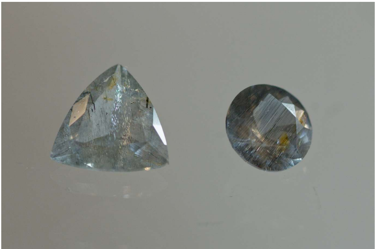
Figure 25: These scapolite gemstones (0.56 ct round and 0.77 ct triangular cut) from Baffin Island, Canada, are essentially brownish grey (a) and turn slightly bluer (b) after about two minutes of exposure to short-wave UV radiation. This photochromism decays so fast (about 3 seconds) that it is challenging to photograph.