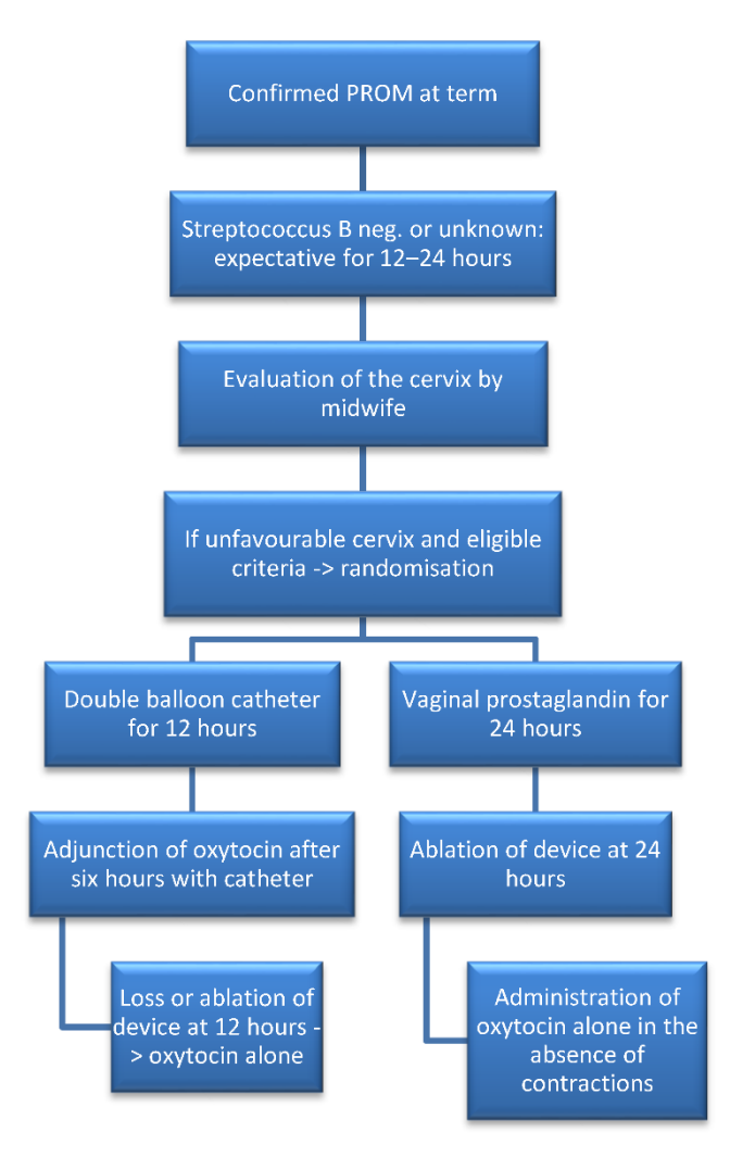
Figure 1. Flowchart describing the main stages of the study.