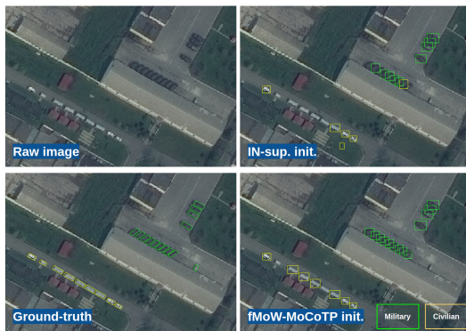
Fig. 3. Example of cherry-picked predictions. In this particular case, the models have been finetuned on the dataset S.

a balanced set of categories, and that such bias may also negatively impact the transfer to under-represented classes downstream. However, further work is needed to provide ground for this hypothesis.