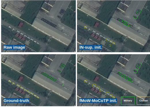
Fig. 3. Example of cherry-picked predictions. In this particular case, the models have been finetuned on the dataset S.

a balanced set of categories, and that such bias may also negatively impact the transfer to under-represented classes downstream. However, further work is needed to provide ground for this hypothesis.