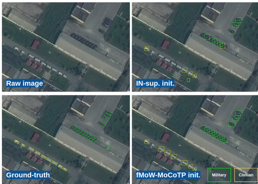
Fig. 3. Example of cherry-picked predictions. In this particular case, the models have been finetuned on the dataset S.

a balanced set of categories, and that such bias may also negatively impact the transfer to under-represented classes downstream. However, further work is needed to provide ground for this hypothesis.