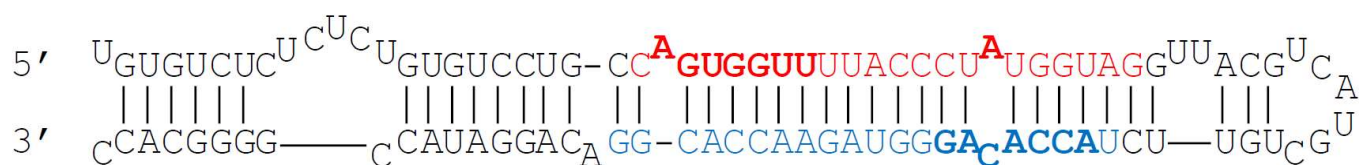
Figure 1. Pre-miR-140 sequence. Representation of the pre-microRNA-140 sequence obtained and modified from miRBase ( https://www.mirbase.org/cgi-bin/mirna_entry.pl?acc=MI0000456 , accessed on 20 August 2022). The mature sequences of miR-140-5p and miR-140-3p are highlighted in red and blue, respectively. The seed regions of each miRNA are in bold.

This review focuses on the roles of miR-140-3p and miR-140-5p in neurodegenerative diseases, atherosclerosis, visual acuity loss, osteoporosis, and osteoarthritis, which are all age-related diseases, and details the molecular targets of these miRNAs involved in aging pathophysiology.